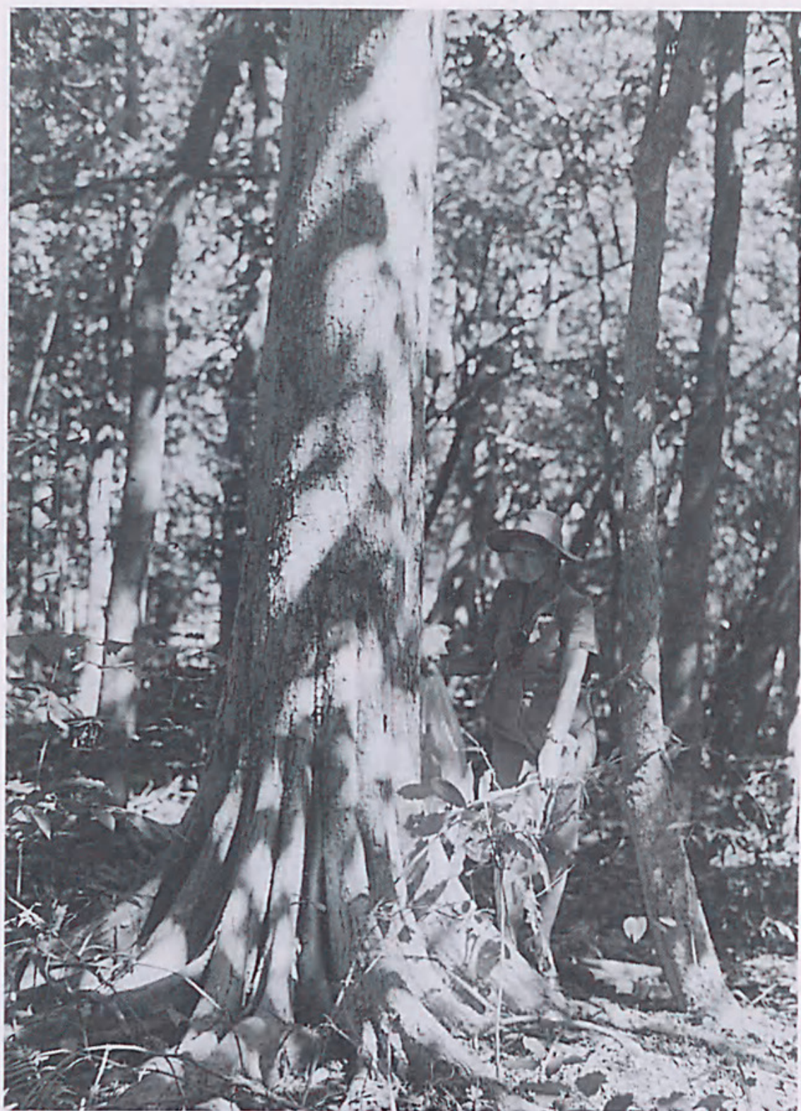
Figure 8. Buttressed roots of Syzygium nervosum in gallery forest.