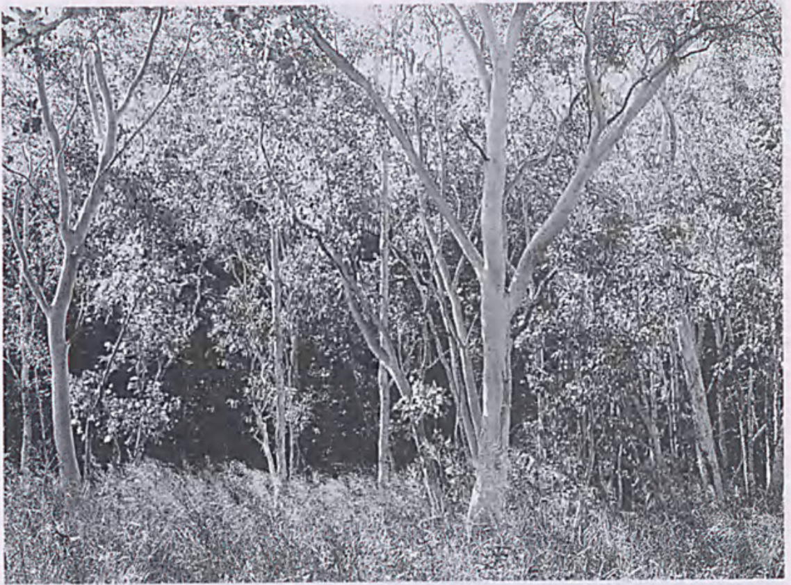
Figure 7. Edge of gallery forest fringing Calder River, dominated by Eucalyptus houseana .

americanus , Ilex arnhemensis , Miliusa brahei , Mimusops elengi , Polyalthia australis , Polyaulax cylindrocarpa , Pouteria sericea and Wrightia pubescens . The vines include Abrus precatorius , Adenia heterophylla , Ampelocissus acetosa , Canavalia papuana , Capparis sepiaria , Flagellaria indica , Ichnocarpus frutescens , Pachygone ovata , Parsonsia velutina , Pisonia aculeata and Secamone timoriensis . The epiphytic orchid Dendrobium affine occasionally occurs.