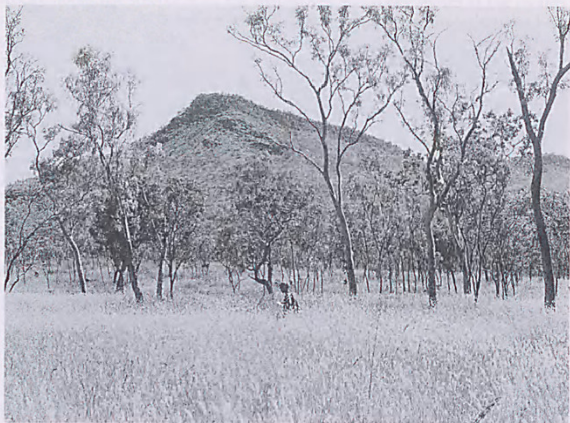
Figure 5. Savanna woodland dominates the alluvial plains with Mount Daglish in the background.