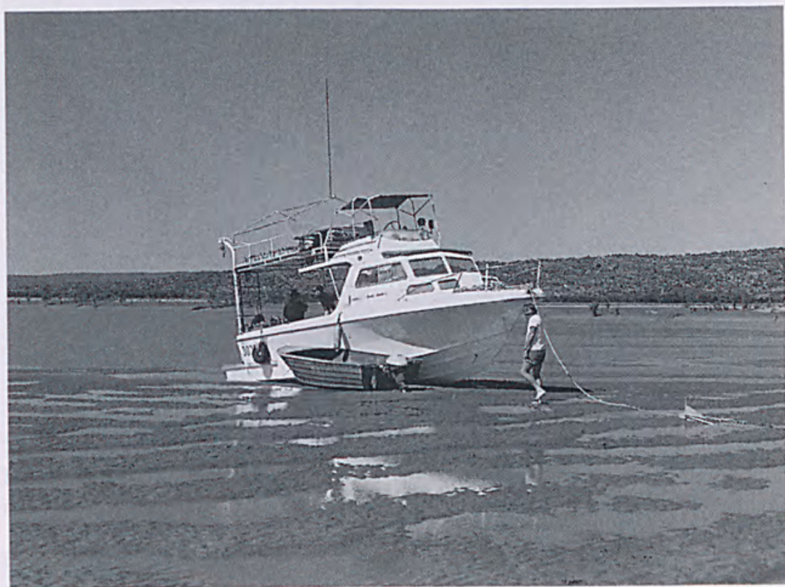
Figure 2. Boat stranded during the emptying of Walcott Inlet at extremely low tide.