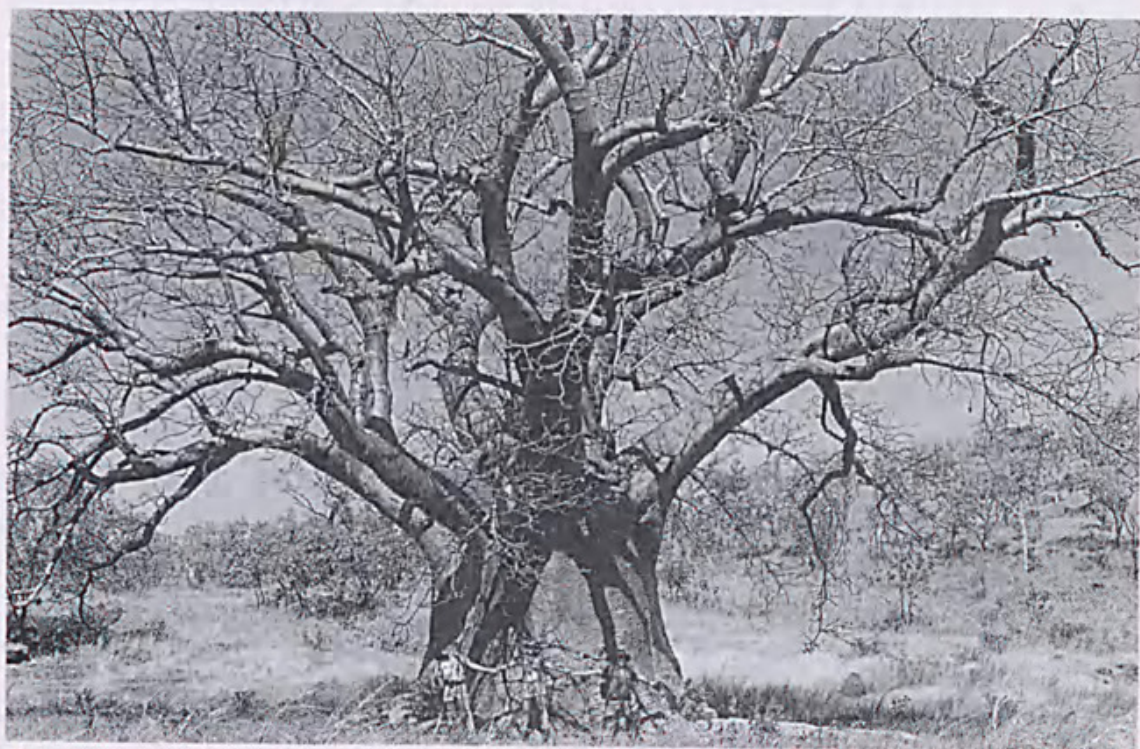
Figure 4. A giant boab ( Adansonia gregorii ) on alluvial plain near old Munja mission.

hirsuta , M. mutica , Mitrasacme hispida and Vernonia cinerea .