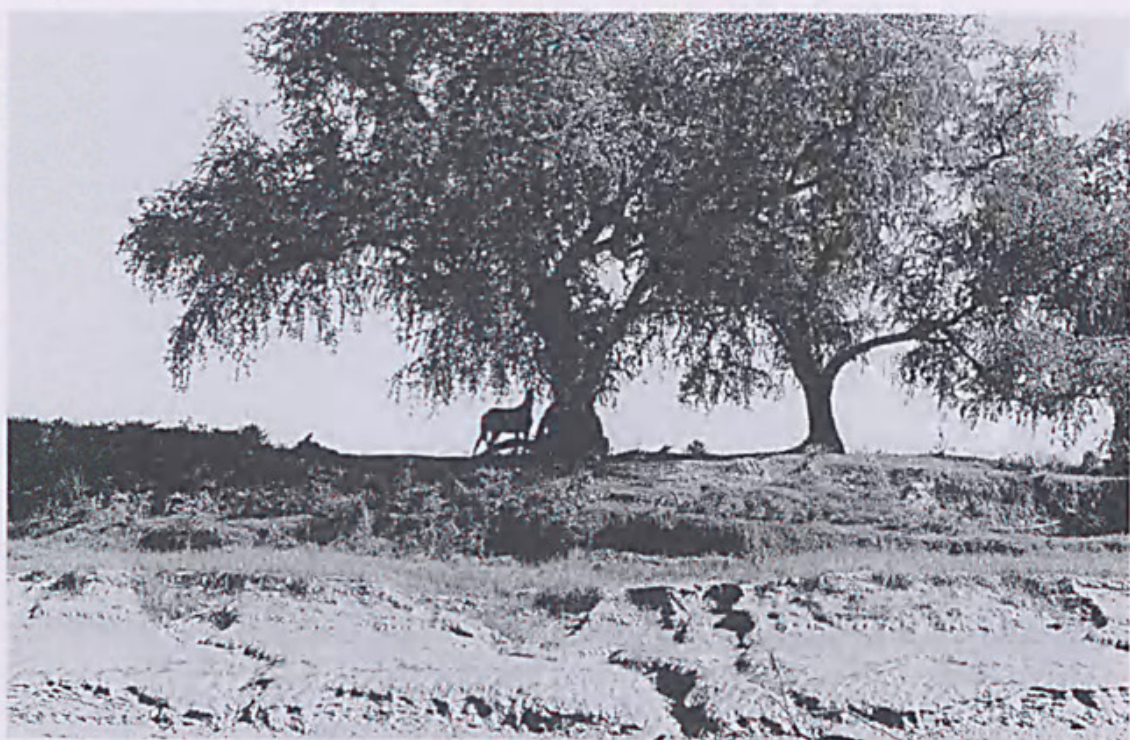
Figure 6. Alluvial banks support groves of baobab ( Lysiphyllum cunninghamii ).

forests. Rainforest species include the trees Aidia racemosa , Aglaia elaeagnoidea , Albizia lebbek , Alstonia linearis , Alphitonia excelsa , Bombax ceiba , Canarium australianum , Celtis philippensis , Cryptocarya cunninghamii , Ficus virens , F. racemosa , Ganophyllum falcatum , Grewia breviflora , Gyrocarpus