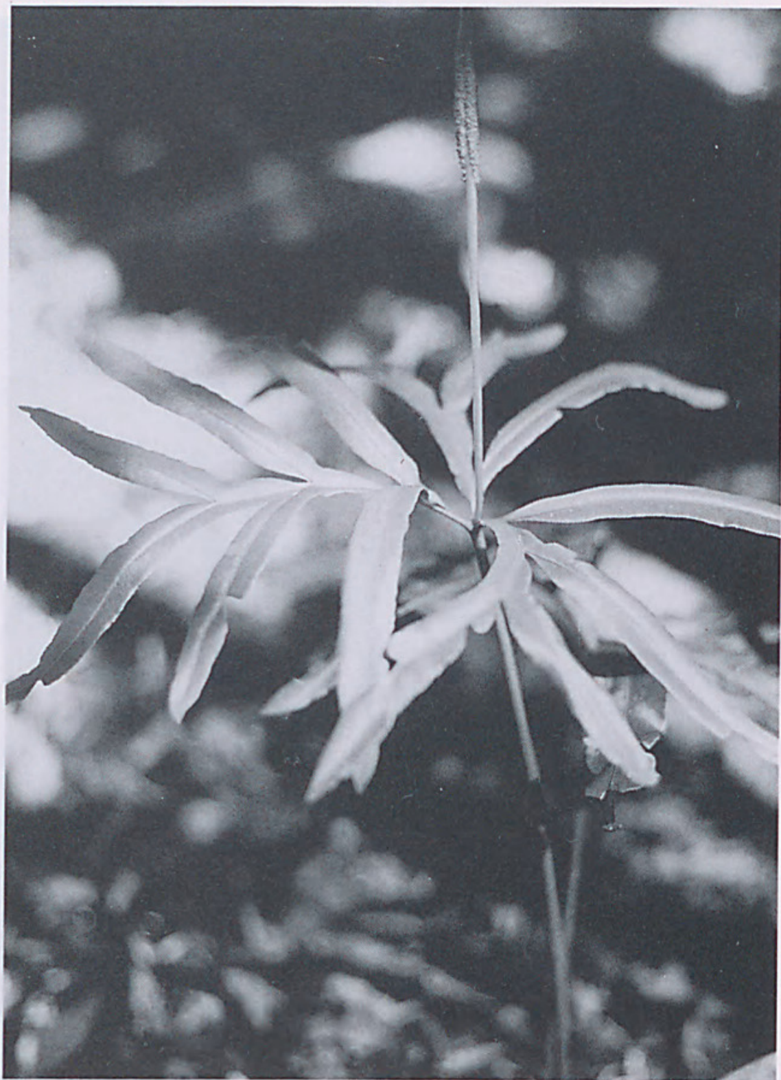
Figure 10. Helminthostachys zeylanica , a rarely collected fern in the gallery forest.

Feral stock are present in limited numbers and the vegetation is in reasonably good condition. Fire ecology in the study area requires further investigation. The absence of permanent settlement reduces a significant source of ignition although some temporary camping takes place at Munja during stock mustering from nearby Pantijan Station.