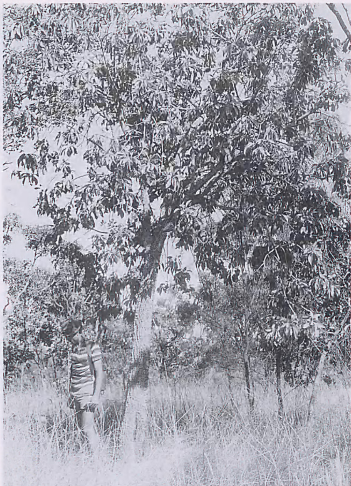
Figure 12. Pouteria arnhemica on sandstone.

The advice and companionship of the late Wattie Ngerdu in helping to understand the traditional Aboriginal significance of the area will always be deeply appreciated.