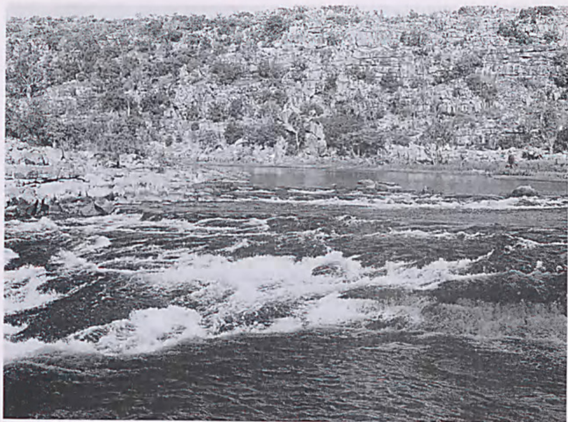
Figure 3. Mouth of the Calder River at eastern end of Walcott Inlet, surrounded by sandstone cliffs.