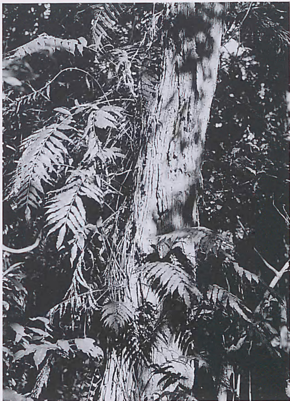
Figure 9. Climbing Swamp Fern ( Stenochlaena palustris ), on trunk of Syzygium angophoroides .