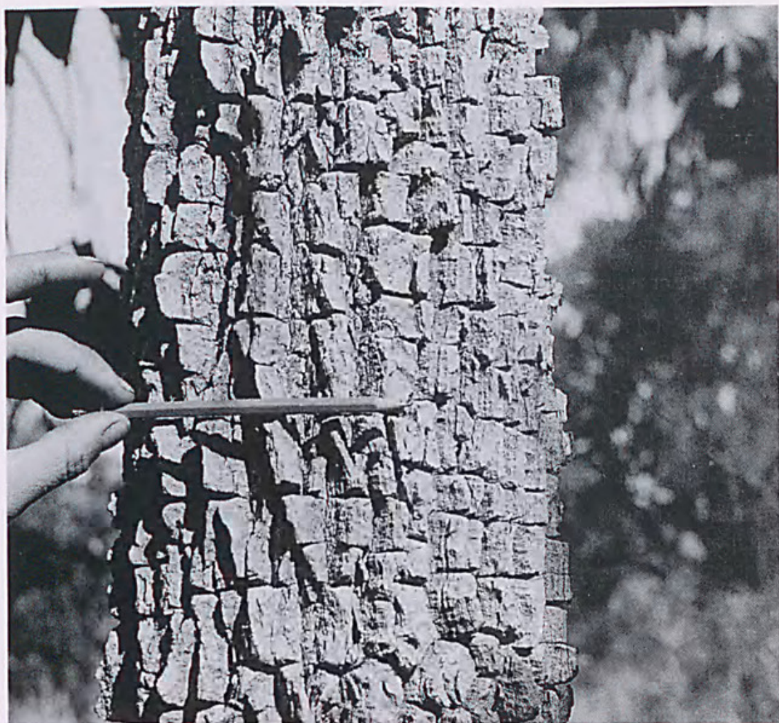
Figure 13. Fissured, corky bark of Pouteria arnhemica .