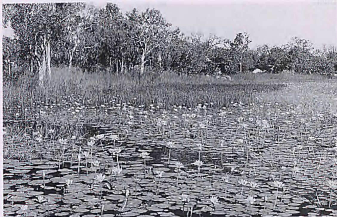
Figure 14. Billabong below sandstone escarpment dominated by blue waterlilies ( Nymphaea violacea ) and chinese water chestnut ( Eleocharis dulcis ). Both plants have edible tubers.