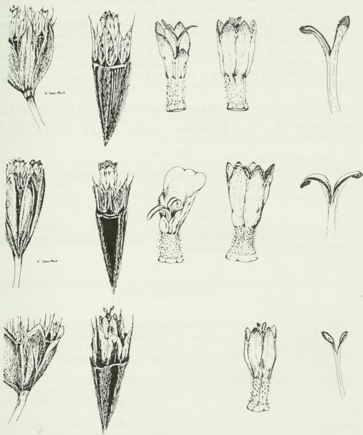
Figure 2. Head and floret variation in Schkuhria pinnata var. wislizeni . Upper row, left to right, head, achene ray floret, disk floret, style branches of disk floret (Pringle 13566 [LL]); middle row (Ellison 20 [TEX]); lower row (with ray florets absent, Pringle 13567 [TEX]).