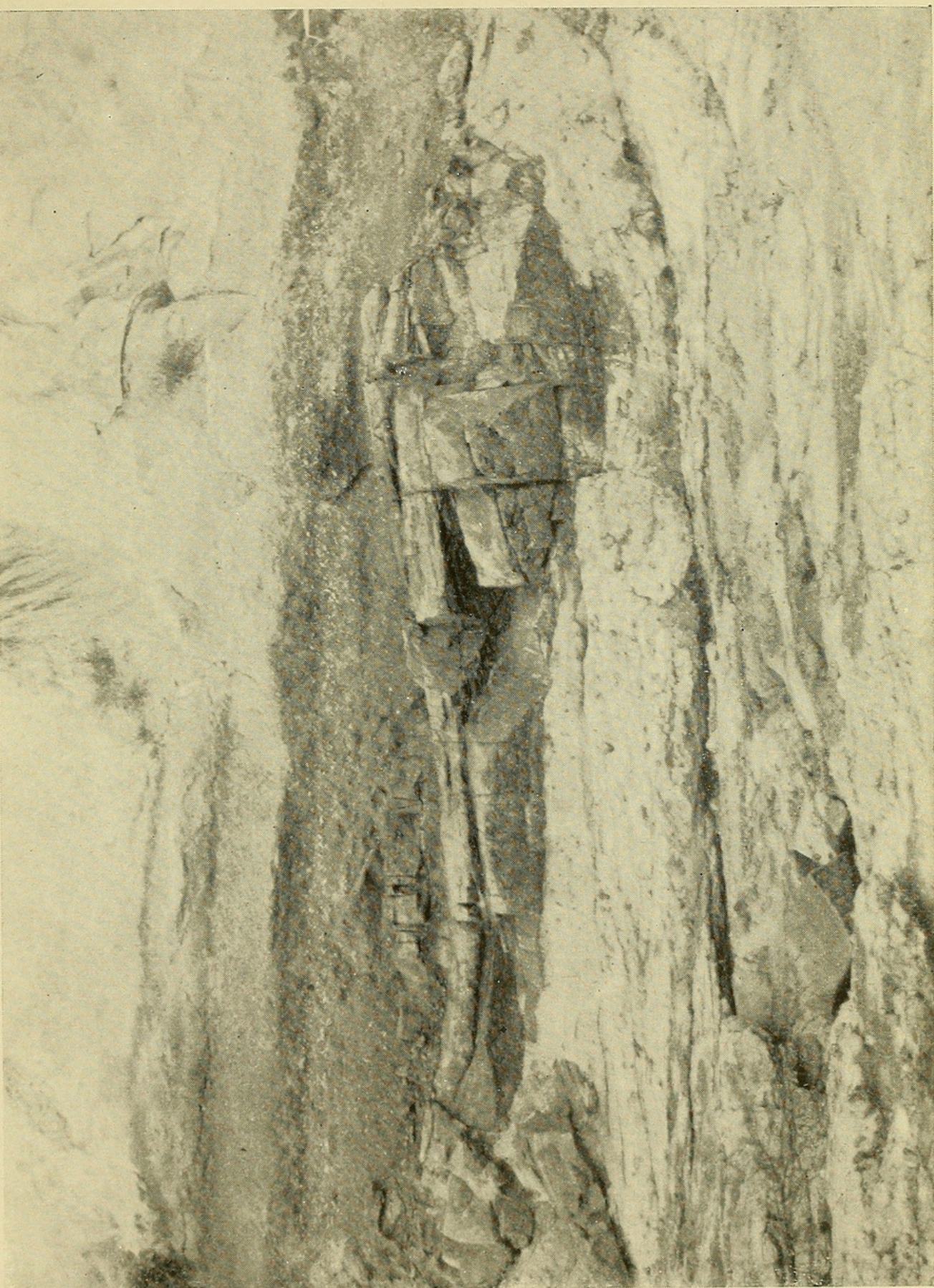
LENTICULAR MASS OF SANDSTONE IN THE MORaine, OVERLAID BY THE CRASSATELLA BED.