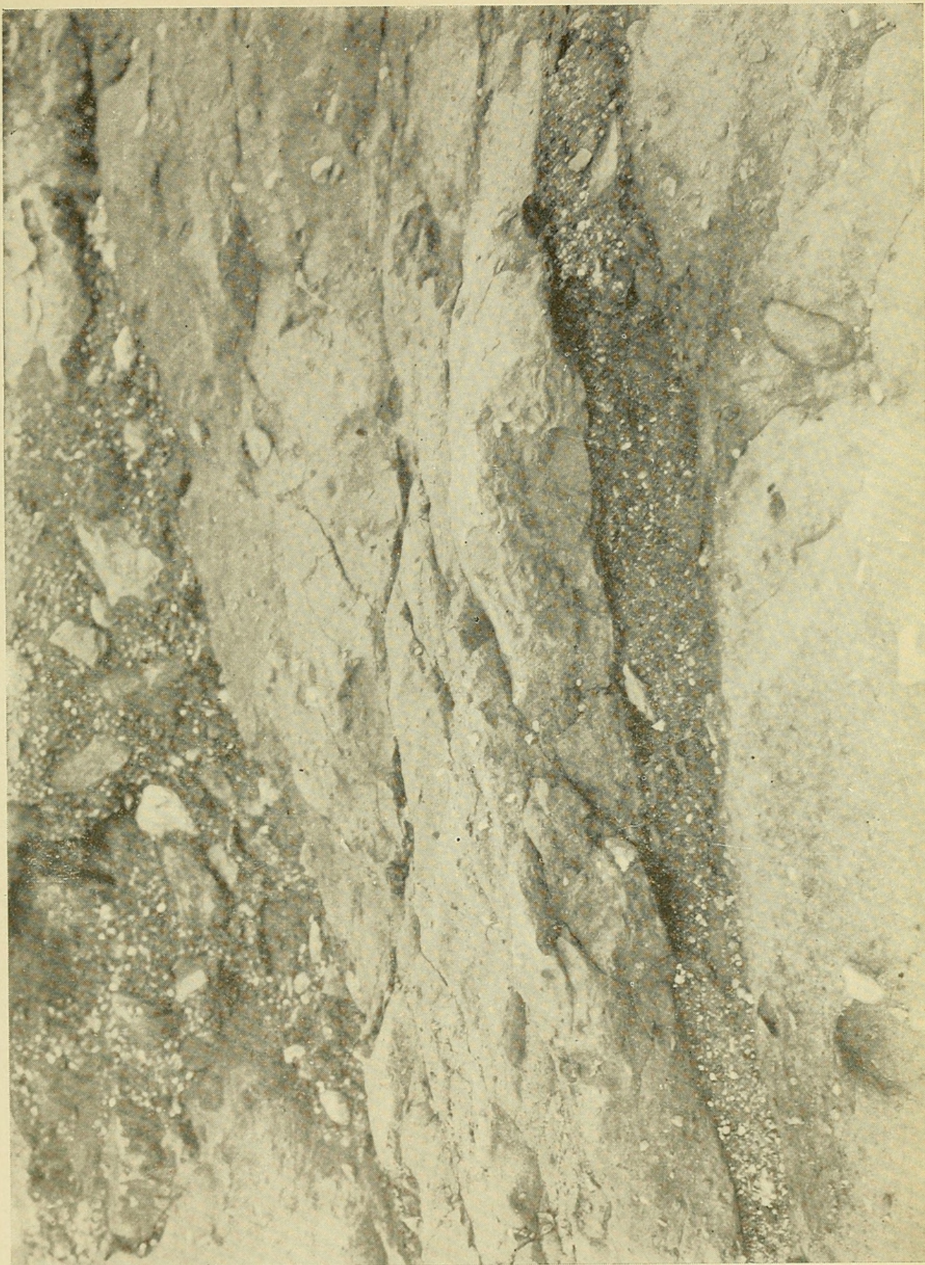
THE CENTRAL PORTION OF THE LAST PLATE ENLARGED. THIS SHOWS THE FOSSILIFEROUS LAYER MORE DISTINCTLY.