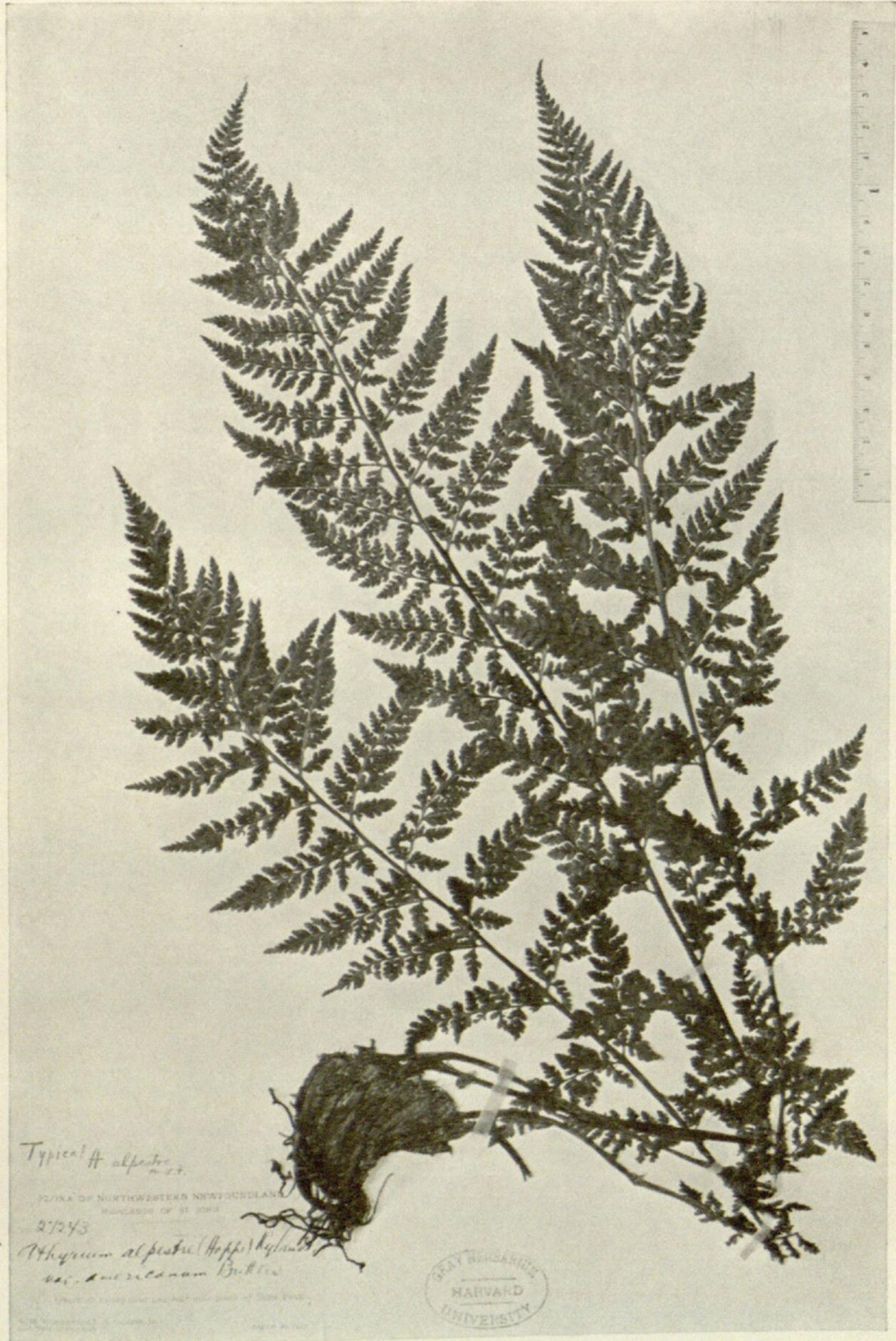
ATHYRIUM ALPESTRE FROM NEWFOUNDLAND, \times \frac{1}{3}