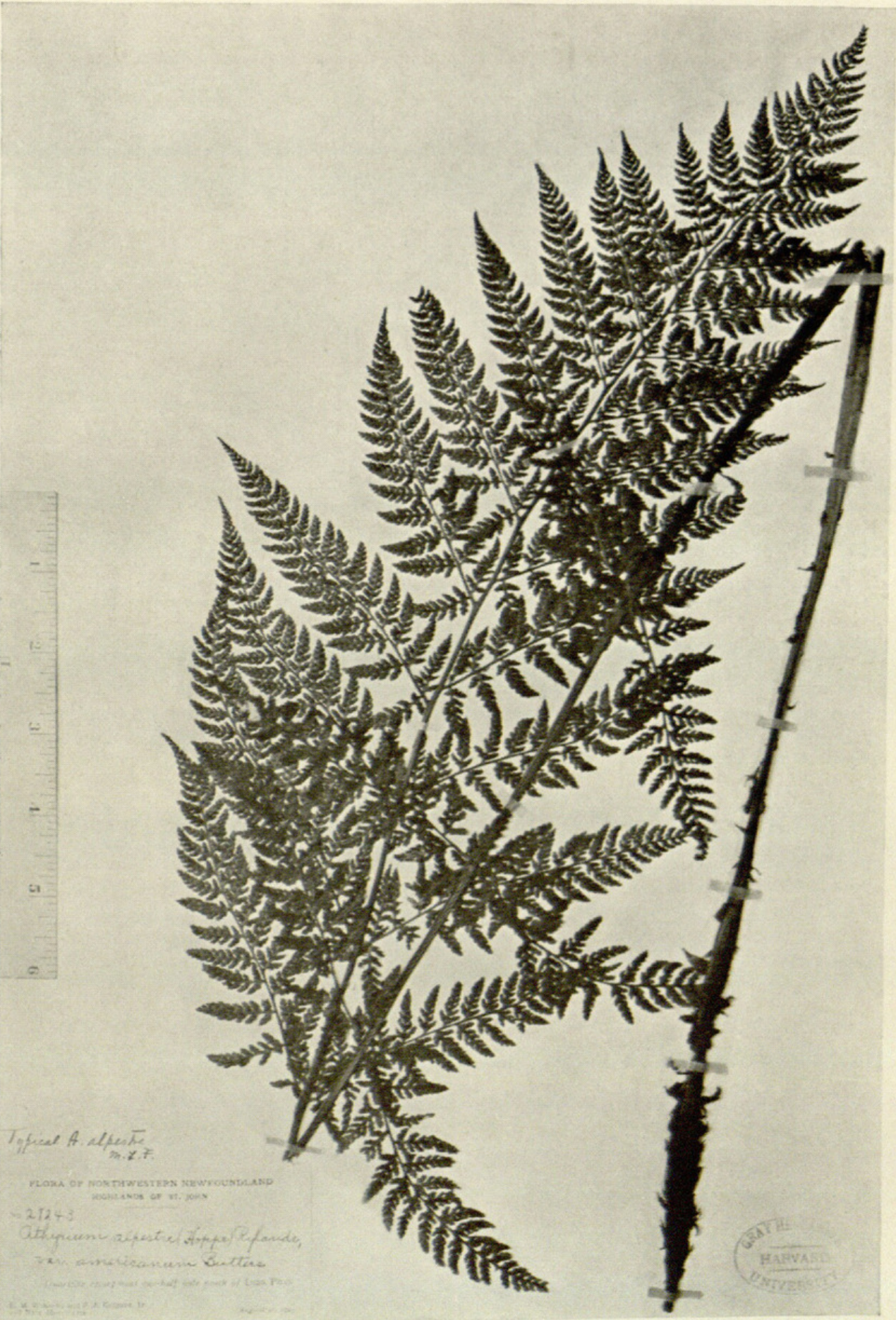
ATHYRIUM ALPESTRE FROM NEWFOUNDLAND, \times \frac{1}{3}