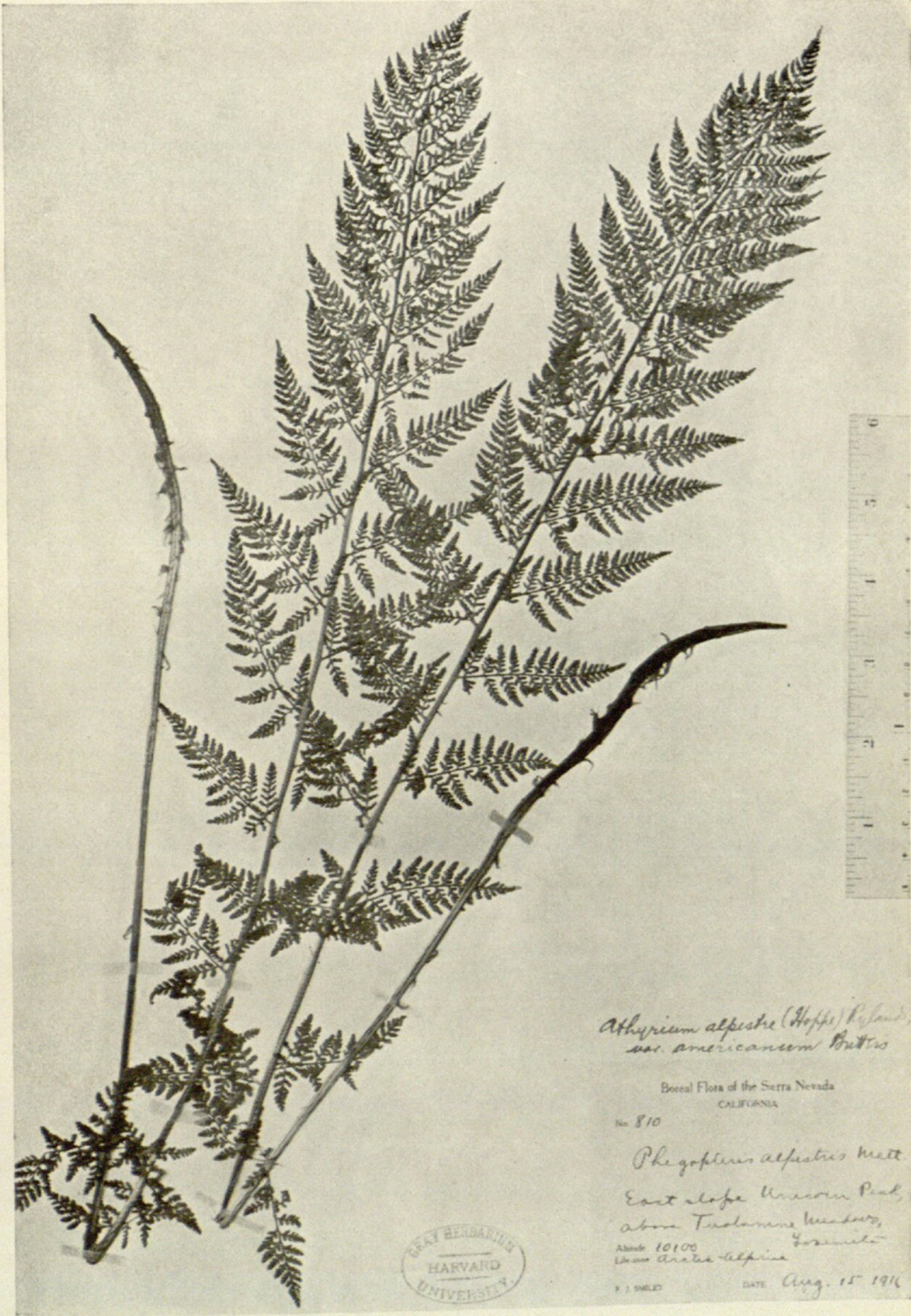
ATHYRIUM ALPESTRE, VAR. AMERICANUM FROM CALIFORNIA, \times \frac{1}{3}