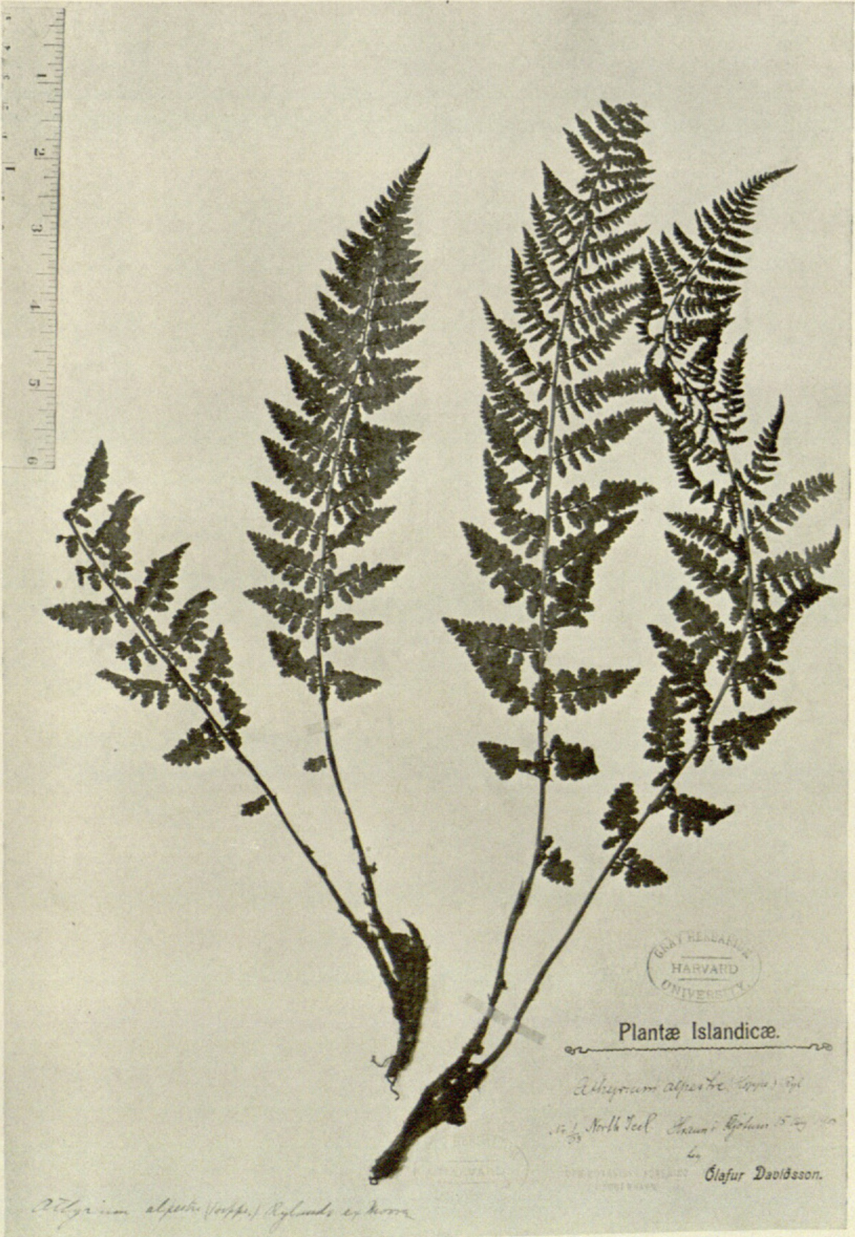
ATHYRIUM ALPESTRE FROM ICELAND, \times \frac{1}{3}