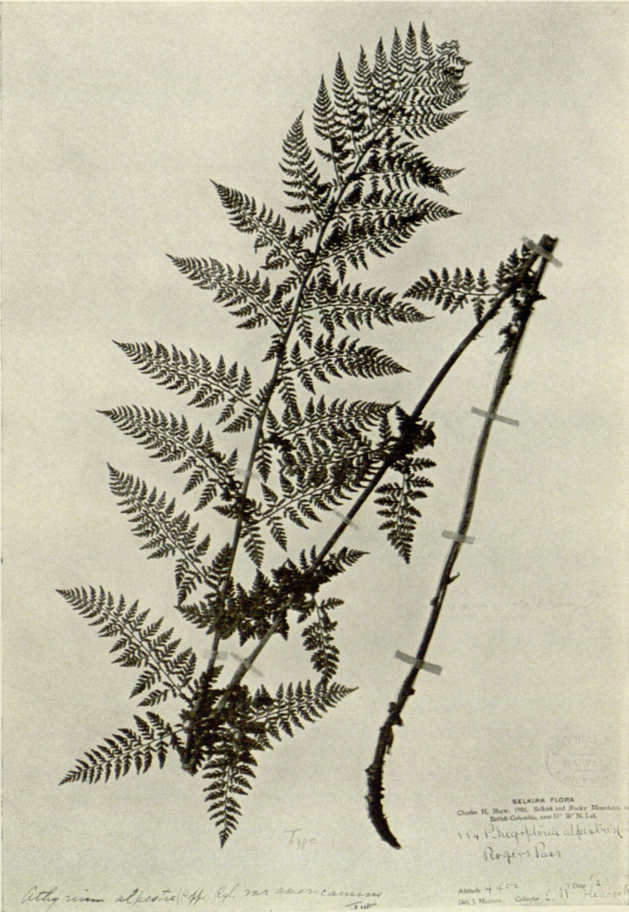
TYPE OF ATHYRIUM ALPESTRE , VAR. AMERICANUM , \times \frac{1}{3}