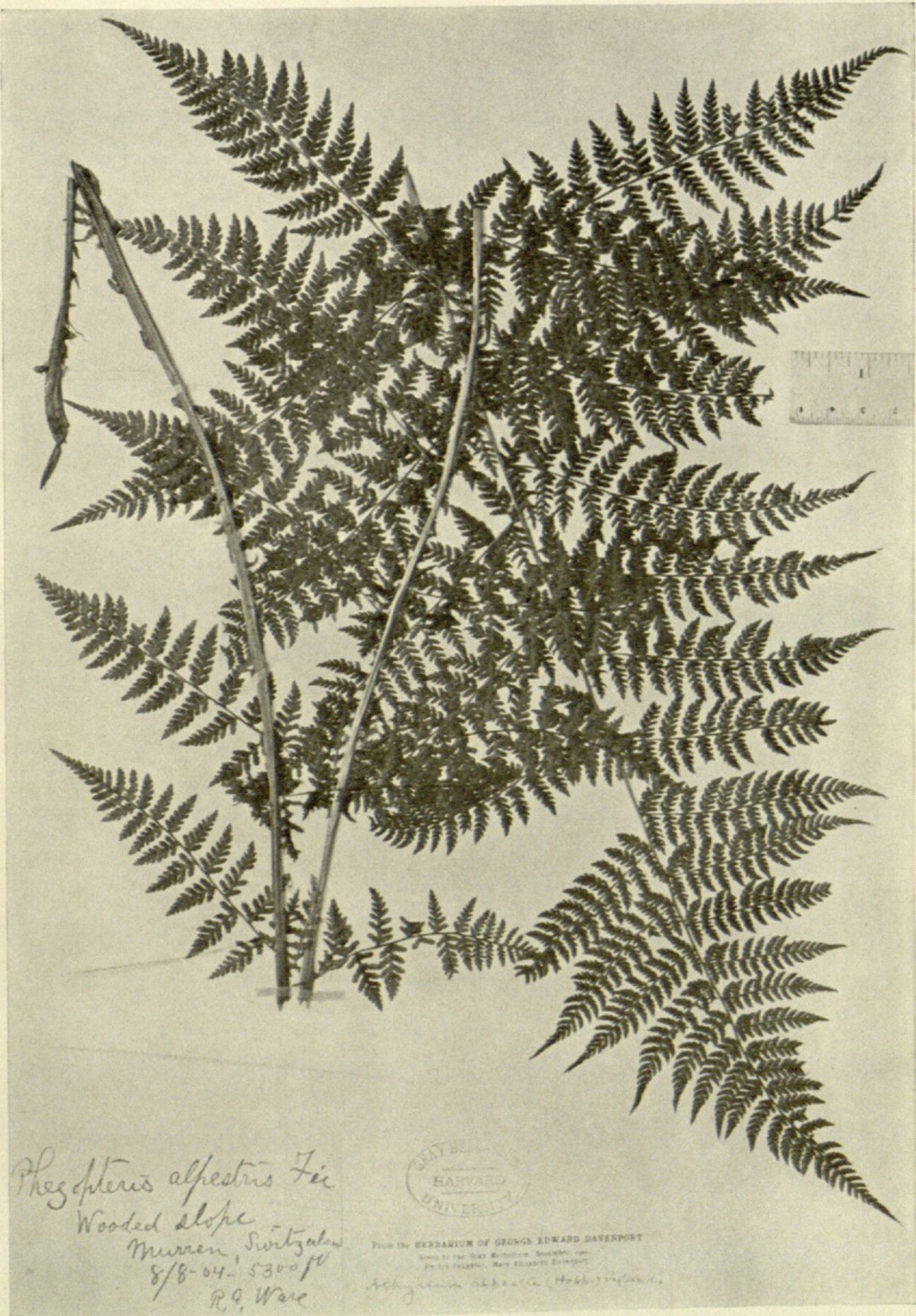
ATHYRIUM ALPESTRE FROM SWITZERLAND, \times \frac{1}{3}