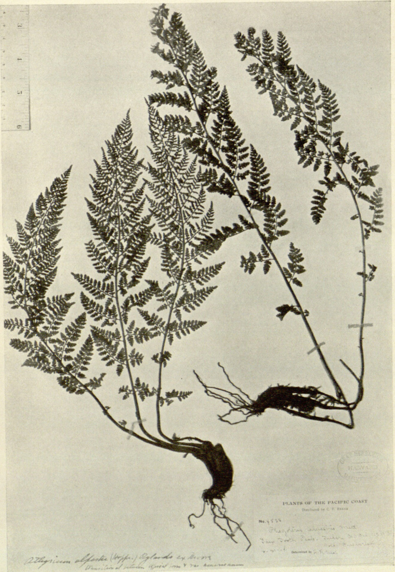
ATHYRIUM ALPESTRE, VAR. AMERICANUM FROM CALIFORNIA, \times \frac{1}{3}