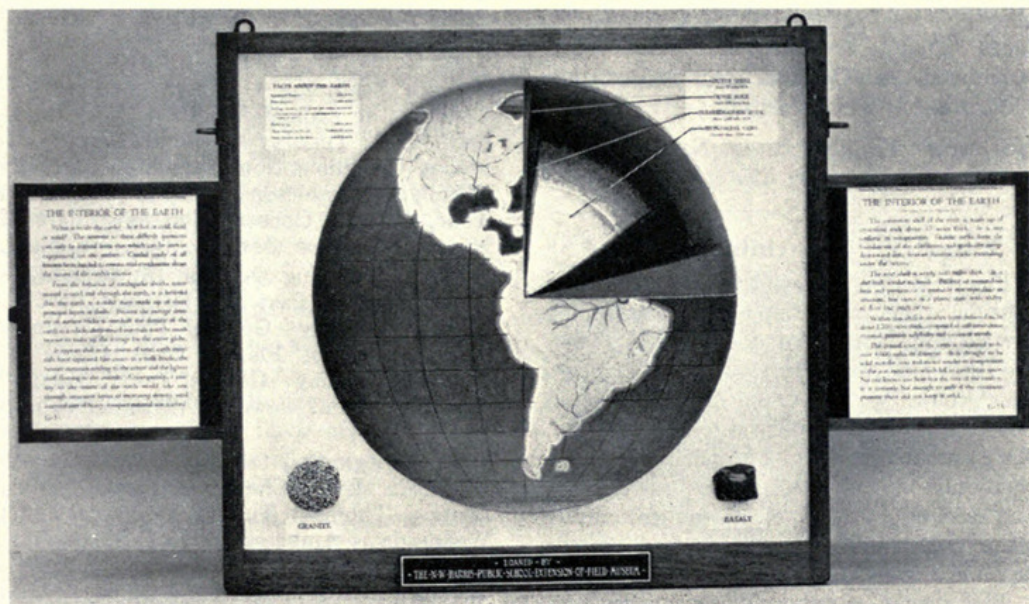
SIMPLIFIED VERSION OF EARTH MODEL FOR SCHOOL CHILDREN

Obviously, the features shown have not been directly observed, since the earth's diameter is 8,000 miles while the deepest excavations for mines have penetrated only into the outer crust, and that for less than two miles. Yet, despite the impossibility of direct observation, the major structural features have been determined indirectly by study and measurement of geological and physical phenomena at the surface.