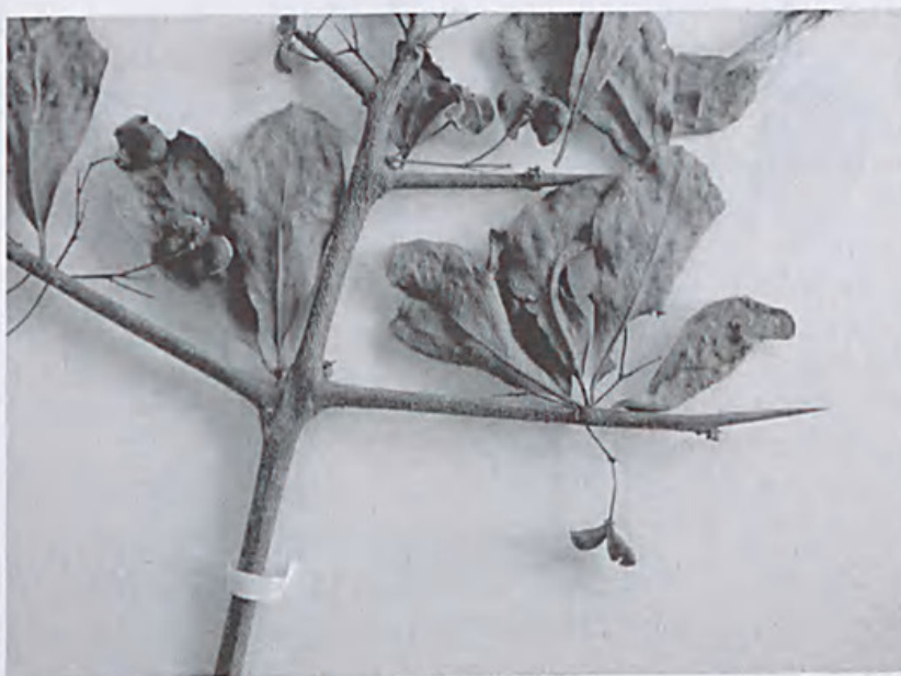
Fig. 3. Gymnosporia littoralis . Thailand: ¼ mile SW of Vayama, Maxwell s.n. L430469 (L).

Scandent or erect shrub, up to 4 m high; branches zigzag, puberulous to muricate, spinescent. Spines up to 15 mm long, of two kinds: spines short, axillary and spines terminating short lateral shoots. Leaves mainly alternate, subcoriaceous; lamina obovate, oblanceolate, or broad-obovate to round, 17–30 × 10–20 (–25) mm, apex obtuse, rounded or emarginate, base attenuate narrowing into the petiole, margin sparsely denticulate or crenulate, or sometimes subentire, principal lateral veins 3 or 4; petiole very short or subsessile. Inflorescences fasciculate or solitary, sometimes 1-flowered, axillary or crowded at upper part of a short-shoot, shorter than the leaves,