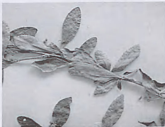
Fig. 2. Gymnosporia spinosa var. parva . Philippines: Rizal Province, Montalban, Elmer 12573 (L).

Distribution and ecology: Thailand and Malaysia. It occurs on limestone at sea level, or in lowland forests.