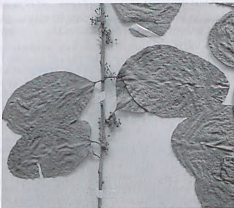
Fig. 1. Gymnosporia inermis . Sulawesi (Celebes): Binongko, Pulau, Elbert 2559 (L).

NEW GUINEA: West Papua: Radjah Ampat, Waigeo Island, Lupintol on SW coast of Majalibit Bay, Van Royen 5454 , 8 Feb 1955, (L); Merauke, Koch Expedition 1904–1905 (L).