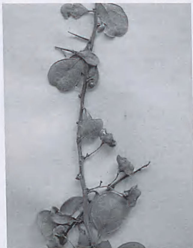
Fig. 5. Gymnosporia emarginata . Sri Lanka: Matale District, Laggala, Cramer 5005 (K).

Leaves ovate, papery, 85–130 long. Inflorescence cymose, many-flowered. Capsules 3-valved, 7–8 mm long and seed with basal aril.