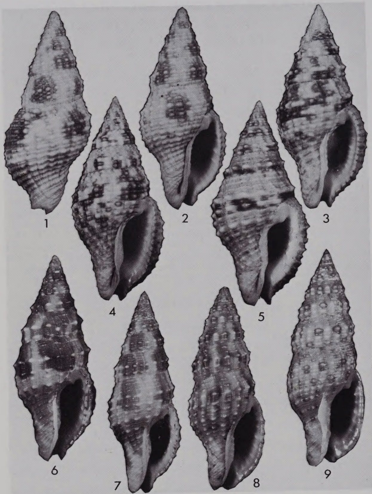
Figs. 1-9. Cantharus (Prodotia) iostomus (Gray in Griffith & Pidgeon). 1,2. Paralectotype of Buccinum marmoratum Reeve, B.M.(N.H.) No. 1979191; 31.4 mm. 3. Specimen from Broadhurst reef, Qld., Australia, AMS No. C-118669; 30.3 mm. 4,5. Specimens from Apia reef, W. Samoa; 29.8 mm and 22.3mm respectively. 6. Specimen from Rabaul, Papua New Guinea; 19.5 mm (intermediate form). 7. Specimen from Broadhurst reef, Qld., Australia, AMS No. C-118668; 22.0 mm (slender form). 8. Holotype of Phos billeheusti Petit, Mus.Nat.d'Hist.Nat.Paris; 28.0 mm. 9. Specimen from Moruroa Atoll, Tuamotu Archipelago; 22.8 mm.