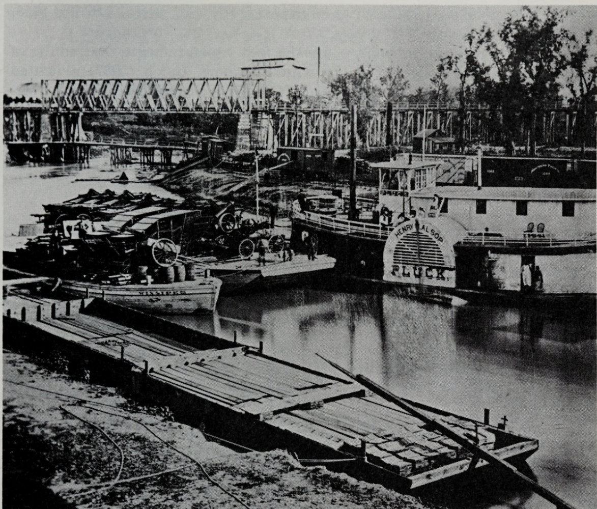
Fig. 1. The Red River of the North at Fargo, North Dakota, in 1879. Ample opportunity for the early introduction of the wharf borer, N. melanura , to Fargo, N. D. was afforded by transportation on this river. Structures offering potential habitat, as seen in this picture, include bridge pilings, rafts, barges, boats and their cargo, and railway ties.

Winnipeg and Lake Winnipeg via the Red River of the North which flows north, emptying into the lake. Much of the early settlement of the Red River Valley occurred from southward migrations from the early 19th century Selkirk settlements in Manitoba. Prior to the railroads, the Red River was heavily used for barge and boat traffic (Fig. 1). The planking of boats and barges, as well as certain items of cargo, were likely means of transport of these beetles from marine port sources. Often the river vessels were constructed of used lumber from older vessels. In addition, this planking was often recycled again when their use on the river was accomplished. Very likely, some infested lumber wended its way to Fargo.