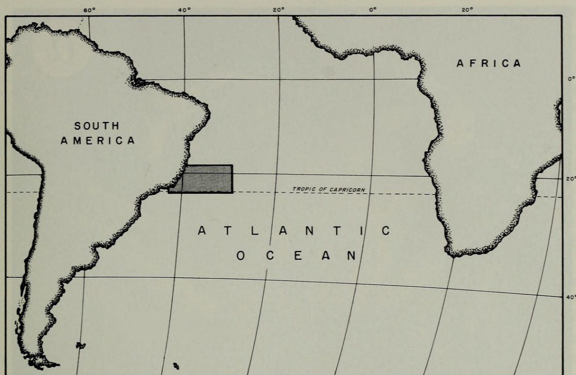
Fig. 1. Area sampled by the Marion Dufresne in 1987.

legs. Carapace 1.1 to 1.2 times broader than long. Median pair of frontal teeth separated by U-shaped sinus. Distance between submedian frontal teeth less than distance between them and lateral frontal teeth. Second, third, and fourth anterolateral teeth obsolete in adults, second and fourth smallest of all; distance from first to third tooth less than that from third to fifth tooth. Carapace with distinct raised ridge mesial to fifth anterolateral tooth, carapace surface finely granular, especially posterolaterally, smooth only at hepatic regions. Suborbital tooth short and broad in adults, not extending to level of lateral frontal teeth. Cheliped merus with sharp tooth subdistally, lacking distal tooth or angled lobe; carpus roughened dorsally, usually with irregular, curved granular ridge extending from middle of proximal margin to inner spine, anterior margin of carpus with at most an angled lobe but no spine; propodus with at most distal angled projection dorsally. Meri of walking legs with at most indistinct distal, dorsal tooth. Dactyli of walking legs depressed, height at midlength less than width.