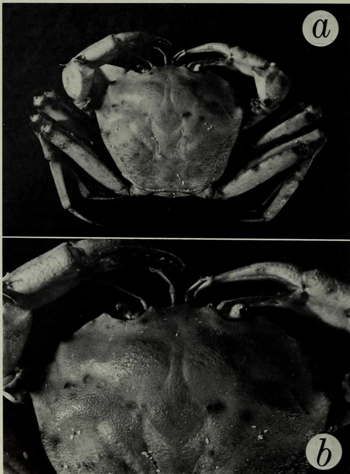
Fig. 2. Chaceon ramosae , male paratype, cl 107 mm, sta. 64 CB 105: a, Dorsal view; b, Carapace.

Remarks. — This species resembles C. quinquedens (Smith, 1879) in having depressed dactyli on the walking legs, but differs in numerous features: the carapace is much more granular posterolaterally, the suborbital tooth is less developed, the car-