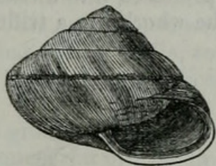
Helix (Camena) congenita.

specimen has a narrow peripheral brown band. The body-whorl is stained with brown outside the tip; and this, owing to the thinness of the shell, produces a brownish labrum, which in some places, particularly at the extreme edge and in the columellar region, is somewhat whitish. It is rather widely expanded at the base and columella, and is a trifle reflexed everywhere. The aperture is very transverse, in fact almost horizontal; it is of a livid white colour within, exhibiting the brown marking of the exterior.