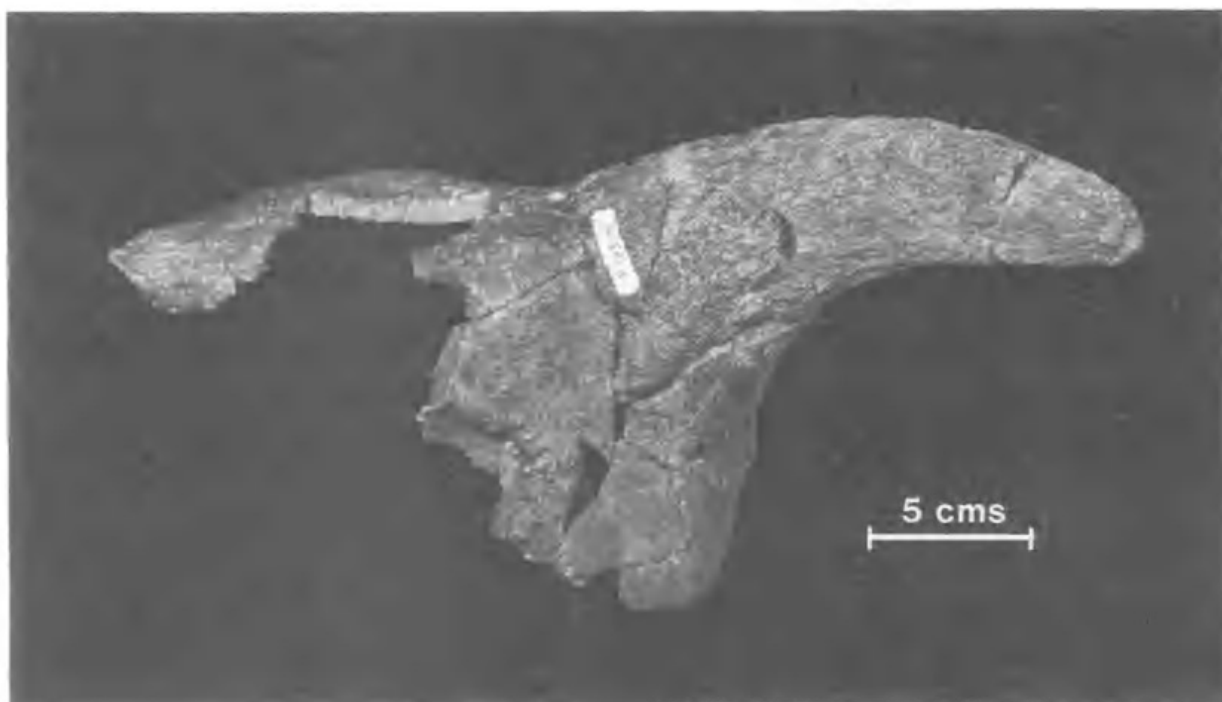
FIG. 2. Meiolania cf. M. platyceps , NMV P183197, Wyandotte Station, Queensland. Lateral view of left B horn core and fragments of skull roof. Anterior to left.