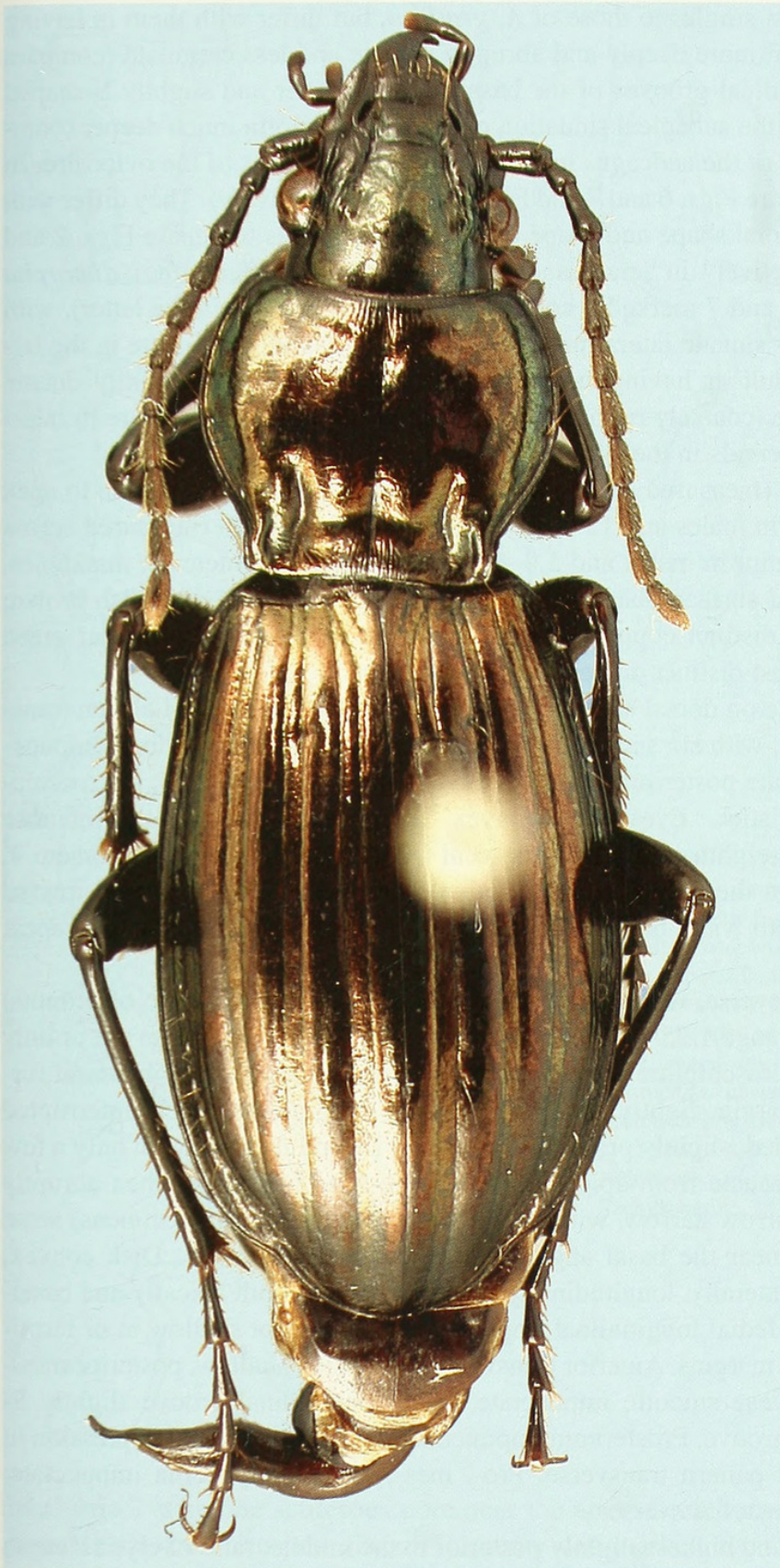
FIGURE 1. Digital photograph of habitus of holotype of Aristochroa abrupta sp. nov., dorsal aspect.

DIAGNOSIS. — Adults of A. abrupta sp. nov. can be distinguished from all other known species of Aristochroa by the following combination of character states: pronotum with lateral margins deeply and abruptly sinuate in posterior one-fifth, parallel anterior to base, with four (three or five in a few specimens) lateral setae anterior to middle, hind angles rectangular, basal foveae smooth, impunctate; pro-, meso-, and metepisterna smooth, impunctate; elytral interval 3 with two (one in a few specimens) discal setiferous pores; elytral intervals 1, 3, 5 and 7 strongly convex, microsculpture distinct on all intervals.