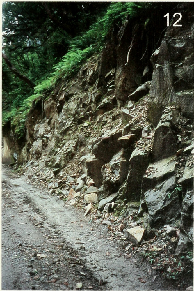
FIGURES 11–12. Photographs of habitat for Aristochroa abrupta sp. nov., eastern slope of the Gaoligong Shan, Gongshan County, western Yunnan Province, China. Fig. 10. Forest in valley of Qiqi He at No. 12 Bridge Camp, 16.3 km W of Gongshan, 2775 m; adult beetles collected mainly in pitfall traps placed on the forest floor in this habitat (at locations marked by pink flagging tape in photograph). Fig. 11. Type locality, valley of Danzhu He, 13.5 km SW of Gongshan, 2380 m; adult beetles collected at night along road cut near or on large granitic boulders.