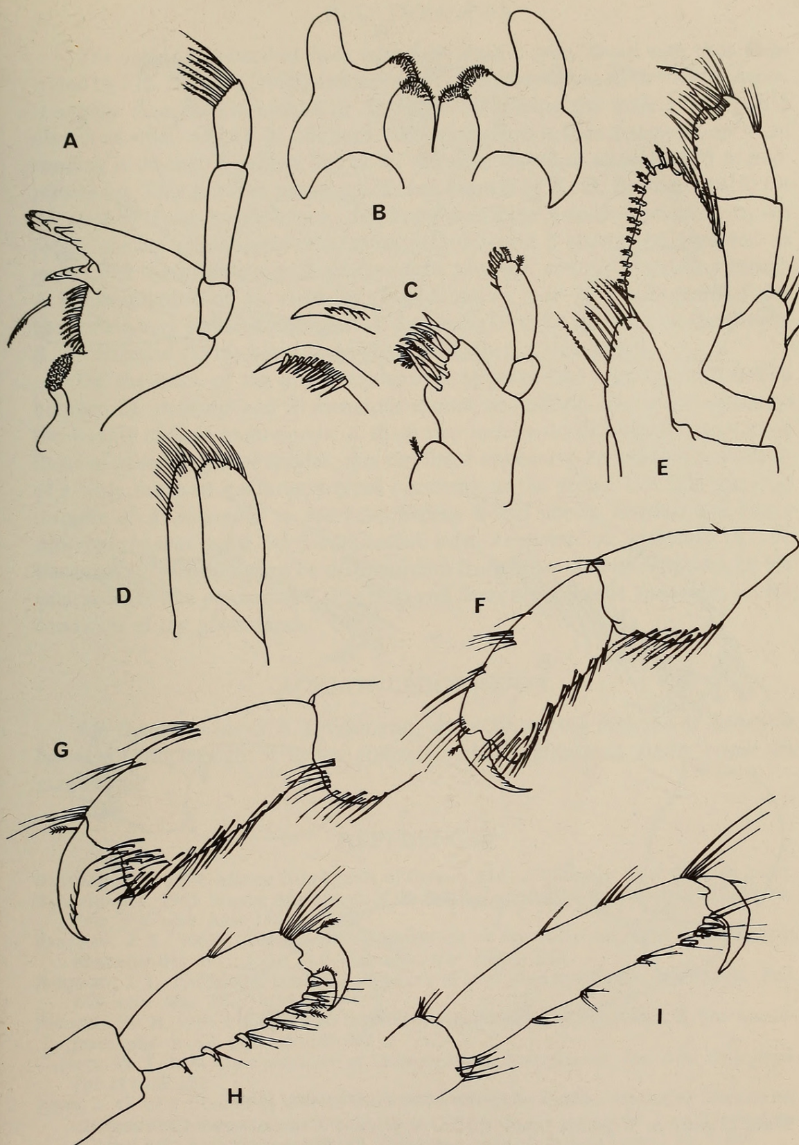
Fig. 2. Ampithoe humeralis Stimpson, 1864.

Male, 15 mm. A. Mandible. B. Lower lip. C. Maxilla 1, with tips of spines enlarged. D. Maxilla 2. E. Maxilliped. F-G. Gnathopods 1, 2. H-I. Articles 6 and 7 of pereopods 3, 5.