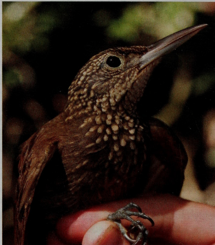
Figure 3. Ocellated Woodcreeper Xiphorhynchus ocellatus perplexus , Manoa, dpto. Pando, Bolivia, May 2005 (J. A. Tobias)