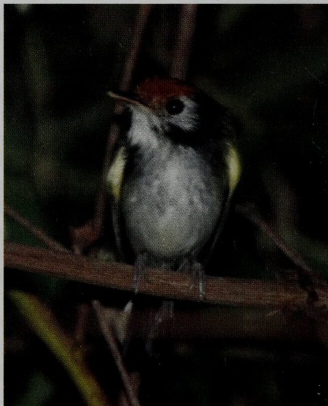
Figure 5. White-cheeked Tody-tyrant Poecilotriccus albifacies , Extrema, dpto. Pando, Bolivia, November 2004 (J. A. Tobias)