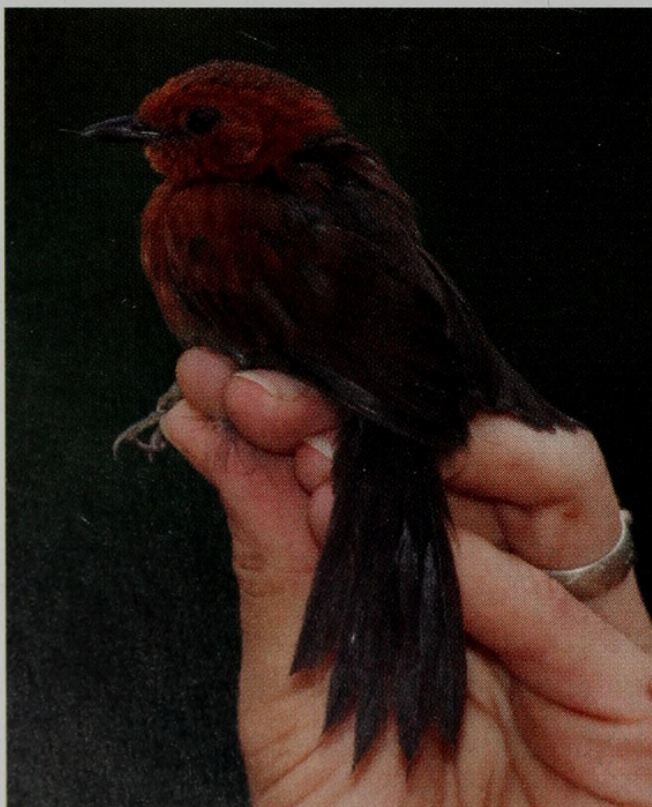
Figure 4. Chestnut-throated Spinetail Synallaxis cherriei , Extrema, dpto. Pando, Bolivia, November 2004