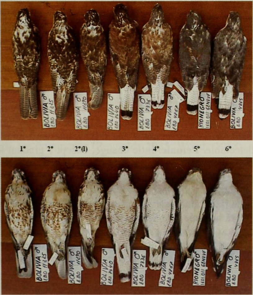
Figure. 2. B. polyosoma pale-phase male plumage patterns according to age. Numbers correspond to calendar year. (l) = late.