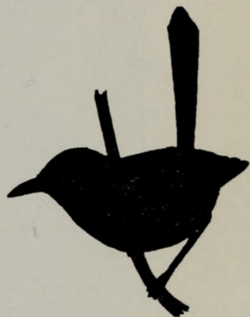
Characteristic posture of Mayrornis schistaceus