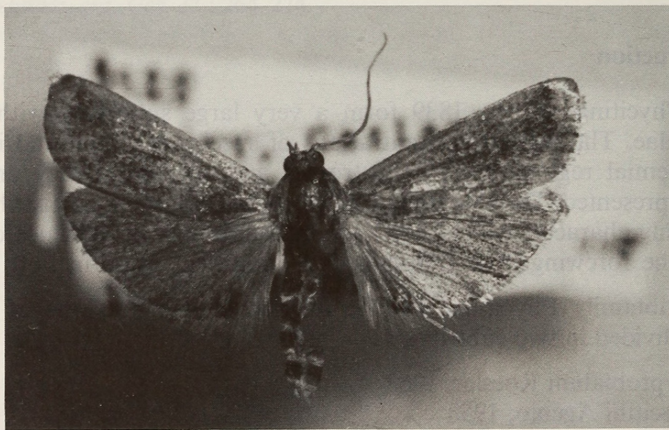
Fig. 1. Holotype ♂, Euzophera fibigerella sp. n., Turkey, Prov. Gaziantep, 16 km NE Kadirli, 700 m, 10.VII.1987 (leg. M. Fibiger).

DESCRIPTION. External characters (fig. 1). Exp. 17 mm, forewing 8 mm. Frons flatly curved, adjacently scaled, without a cone of scales. Proboscis entirely rudimentary. Labial palps slightly upcurved, 1,5 \times