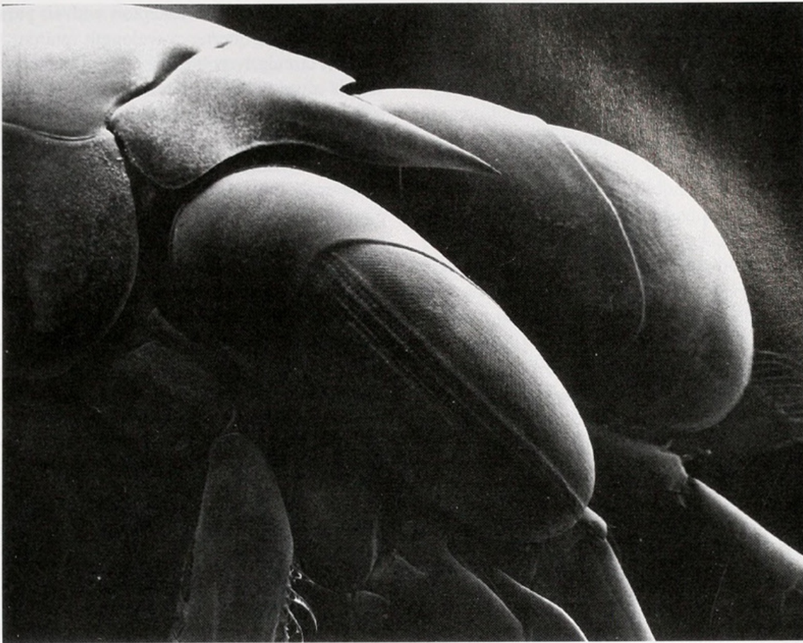
Figure 1. The anterior end of an adult mantis shrimp, Neogonodactylus oerstedii , imaged by scanning electron microscopy. This species is found throughout the Caribbean, living in coral rock and coralline algae. The visual regions of the compound eyes, revealed here by the densely packed facets (each of which represents the cornea of a single ommatidium), lie at the ends of stalks that pivot at their proximal ends. Each compound eye consists of two flattened hemispheres separated by six parallel rows of ommatidia, called the midband. Magnification: approx. 30 \times .

Figure 2 is a diagram of a typical ommatidium from the hemispherical regions of the eye outside the midband. The top half of this structure, including the refracting cornea and the underlying crystalline cone, is devoted to optics, focusing light on the top of the photosensitive structure, called the rhabdom. This rhabdom is constructed from eight receptor cells formed into a single light guide. It consists of a small upper tier, produced by receptor cell number 8 (R8), and a much longer underlying tier formed by contributions from receptor cells numbered 1 to 7 (R1–7). R8 is sensitive only to ultraviolet light (Cronin et al. , 1994b; Marshall and Oberwinkler, 1999), but the fused receptor produced by R1–7 is sensitive to middle-wavelength light, near 500 nm (see Cronin and Marshall, 1989a, b). The R8 receptor is polarization-insensitive, as its microvilli are not all parallel, but the two sets of receptors in the main rhabdom have orthogonal microvilli and are very sensitive to the plane of polarization (see also Marshall, 1988; Marshall et al. , 1991a). Axons from these two receptor sets converge onto higher order interneurons (Horwood and Marshall, unpubl. obs.), which could explain how polarization opponency arises in mantis shrimp vision (see Yamaguchi et al. , 1976).