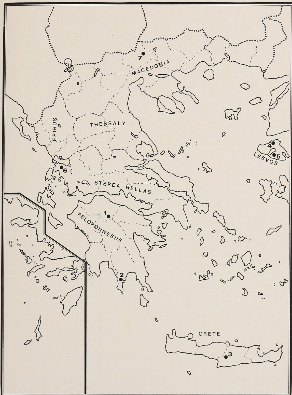
Fig. 1. Map of Greece showing the localities of the specimens of Myotis blythii studied in this paper. — 1, cave "Limnon", Achaia; 2, Flomochorion, Laconia; 3, cave "Micro Labyrinthaki", Eracleion; 4, Mithymna; 5, Polychnitos; 6, Monastiracion, Acarnania; 7, cave "Saranta Camares", Kilkis.