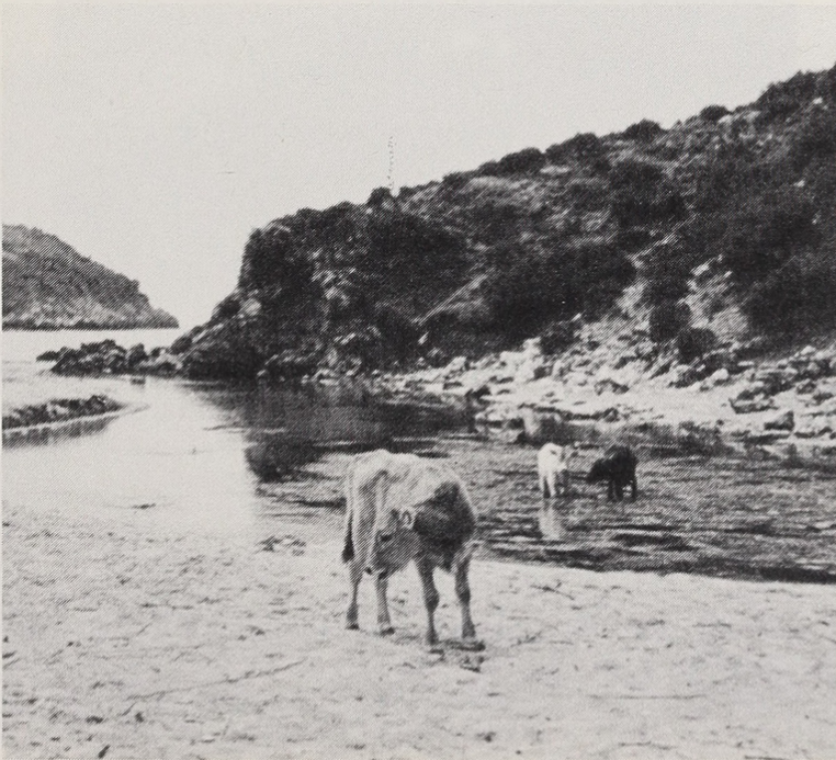
Fig. 2: Creek at the north of the bay near the mouth of the Aheron-River at habitat 1.

The Aheron is one of the great rivers which drain from the highlands of Epirus into the Ionian Sea. It springs forth near Mount Tomaros and flows into the sea after a course of about 60 km, south of Parga. The flat at the mouth of the Aheron river is almost circular and measures about 3 km in diameter. It opens in the west to a bay of a width of 500 m which in the north and in the south is bordered by rocky hills which extend in the sea. These hills enclose the flat like a horseshoe. Opposite to the bay, near the village of Mesopotamo at the road from Preveza to Parga, the hills are lowest. Here, the Aheron-river enters the flat. In the southwestern part near the beach at the right side of the mouth of the Aheron-river, the small village of Amoudia is situated. An