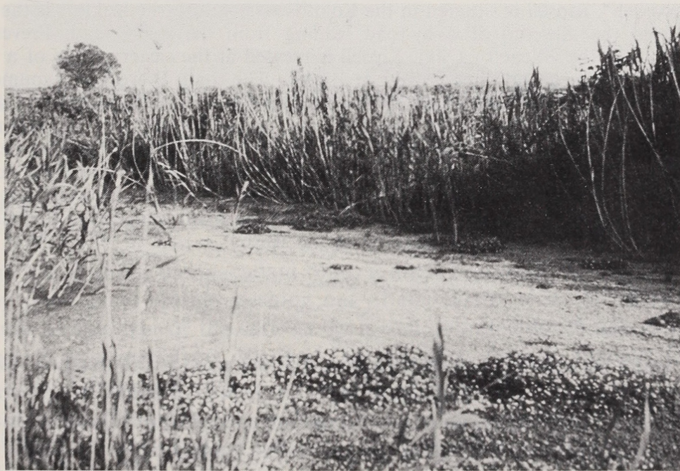
Fig. 4: Habitat 2. The surface of the water is covered by a dense layer of crisped, spherical algae.

Upstream, the current of the creek slowed down. After a few hundred meters, the salinity decreased until salt no longer could be tasted. The contents of minerals remained great. The source of brackish water in the lower course of the creek could not be detected. No surface affluent could be seen. Upstream, at decreasing flow, a thick layer of spherical ( \varnothing : 0.5–1.5 cm), crisped green algae covered the surface of the water. When at random pulling the spoon net through this layer of floating algae near the bank, up to 6 V. letourneuxi could be caught with the net. Females were more numerous (5 x) than males. The ratio of the number of Gambusia and the number of Valencia caught which was 3 near the mouth (habitat 1) decreased until, at habitat 2, no Gambusia was found.