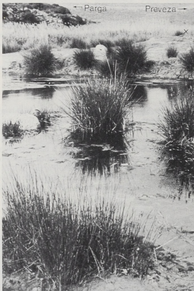
Fig. 3: Habitat 1. In the bights and in the stagnant water near the bank V. letourneuxi was found. At the slope of the hill in the background, the road from Preveza to Parga can be seen. At the bottom of the hill (X) habitat 2 is situated.

asphalt road of a length of 3 km leads from Mesopotamo to this site. The marshy flat is drained by some ditches. Where the marshy ground is sufficiently solid, the green flat is used as pastureland (horses, cattle, goats, pigs). In the environment of Mesopotamo, cotton is cultivated. The neighbouring hills are sparsely covered with Xerophytes which are grazed by sheeps and goats.