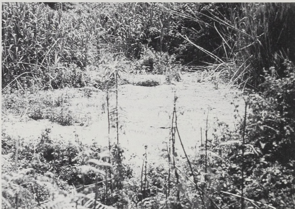
Fig. 6: Habitat 3. A spring in the valley west of the village of Kipseli. The surface of the water is covered by a dense layer of Lemna trisulca .

In the habitats of this valley (3–5), no Gambusia affinis could be found.