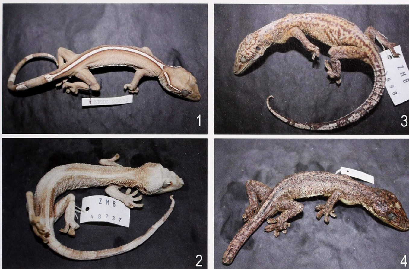
Figs 1–4. 1. Gekko vittatus phenotype 1, ZFMK 20612, male, Pulau Ambon, Indonesia; 2. Gekko vittatus s.l. phenotype 2 (sp.n.), ZMB 5698, female, Republic of Palau; 3. Gekko vittatus s.l. phenotype 3, ZMB 48737, male, Kei Islands, Indonesia; 4. Gekko vittatus s.l. phenotype 4, SMF 9159, male, Nissan Atoll, Green Islands, Papua New Guinea.

data obtained from 21 specimens [28 characters; including specimens from all four phenotypes identified in the present study as well as one of the syntypes of G. bivittatus (MNHN 6714) and the holotype of G. trachylaemus (ZMB 7511)] revealed that the two respective type specimens fall far outside of the remaining clusters. Hence, and supported by the finding that more differences in colouration are present between those two nominal taxa and the four phenotypes of G. vittatus s.l. (see next paragraph), we consider the evaluation of the taxonomic status of G. bivittatus and G. trachylaemus as not within the scope of the present study, because we shall deal with these nominal taxa in detail in a forthcoming paper.