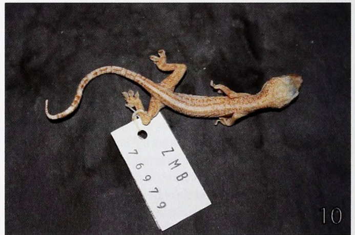
Figs 6–10. 6. Syntype of Platydictylus bivittatus , MNHN 6714, male, New Guinea; 7. Syntype of Platydictylus bivittatus , MNHN 2285, female, Pulau Waigeo, Indonesia; 8. Holotype of Gekko trachylaemus , ZMB 7511, male, Australia; 9. Holotype of Gekko remotus sp.n., ZFMK 20611, male, Republic of Palau; 10. Gekko remotus sp.n., ZMB 76979, juvenile, Republic of Palau.