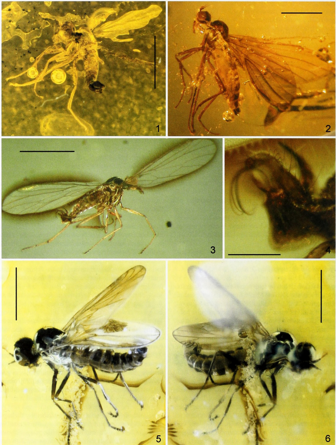
Figs 1–6. Habitus and male terminalia photographs of Baltic amber species of Ragas . 1. R. electrica , male. 2. R. succinea , female. 3. R. eocenica , male. 4. R. eocenica , male terminalia. 5. R. ulrichi , male, right side. 6. R. ulrichi , male, left side. Scale bar = 1.0 mm, except Fig. 4 where scale bar = 0.25 mm.