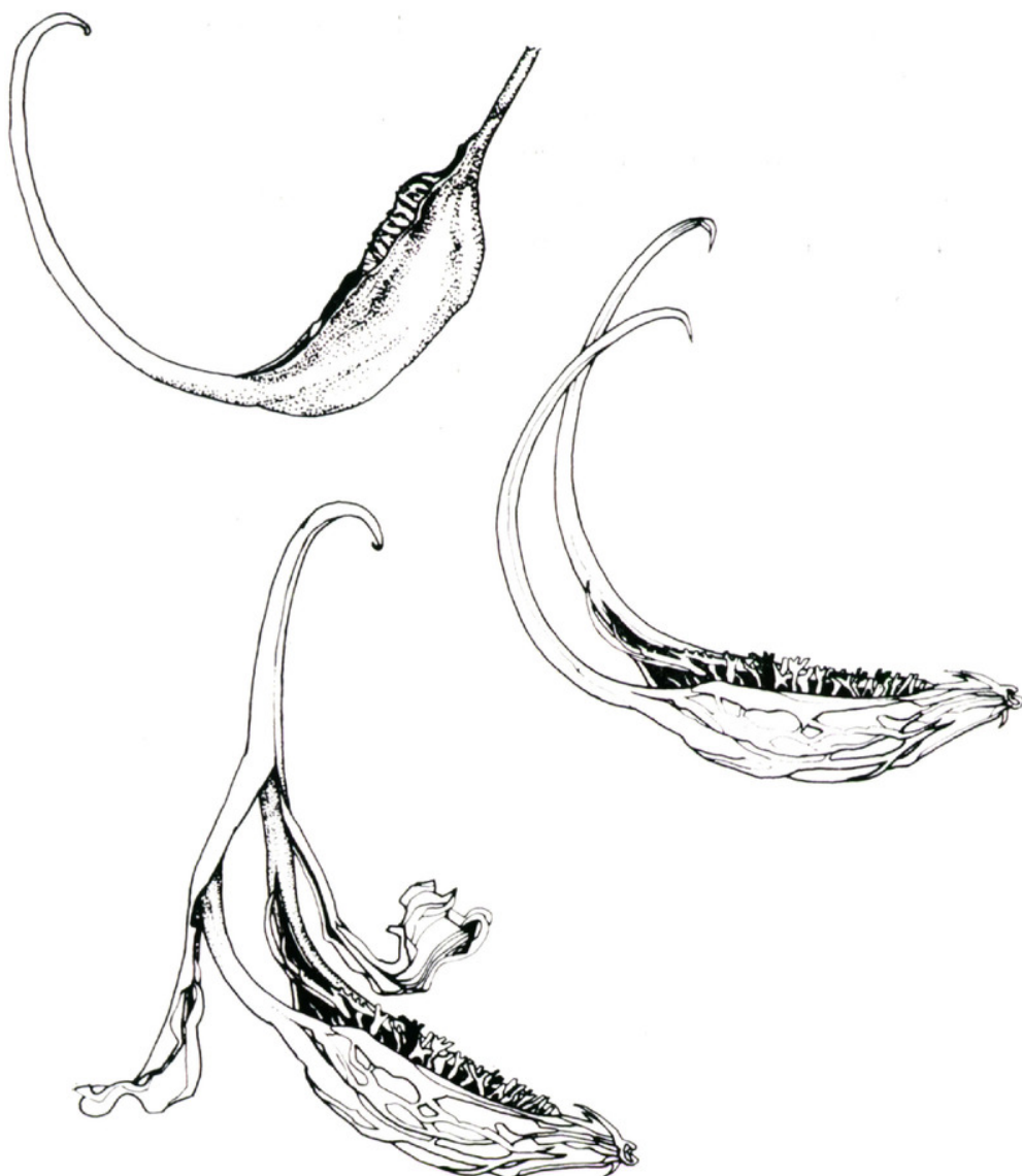
Fig. 3. Fruits of Proboscidea louisianica . Upper left: fruit not yet shed from plant, splitting of exocarp beginning to reveal crest. Lower left: fruit shed, lying on ground, exocarp sloughing off, fruit beak and body splitting longitudinally. Right: fruit with exocarp gone and longitudinal splitting completed.