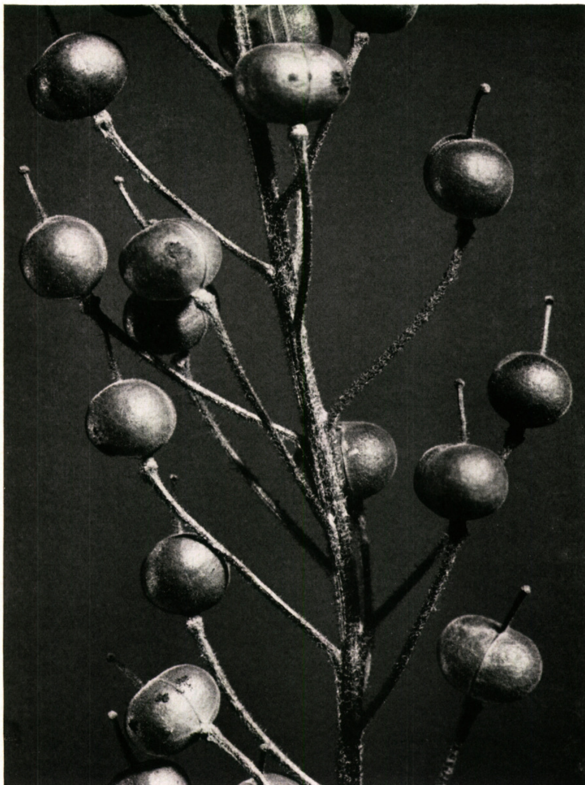
PLATE 1208. Lesquerella densipila . Part of an infructescence, \times 6 (Rollins & Quarterman 55146).