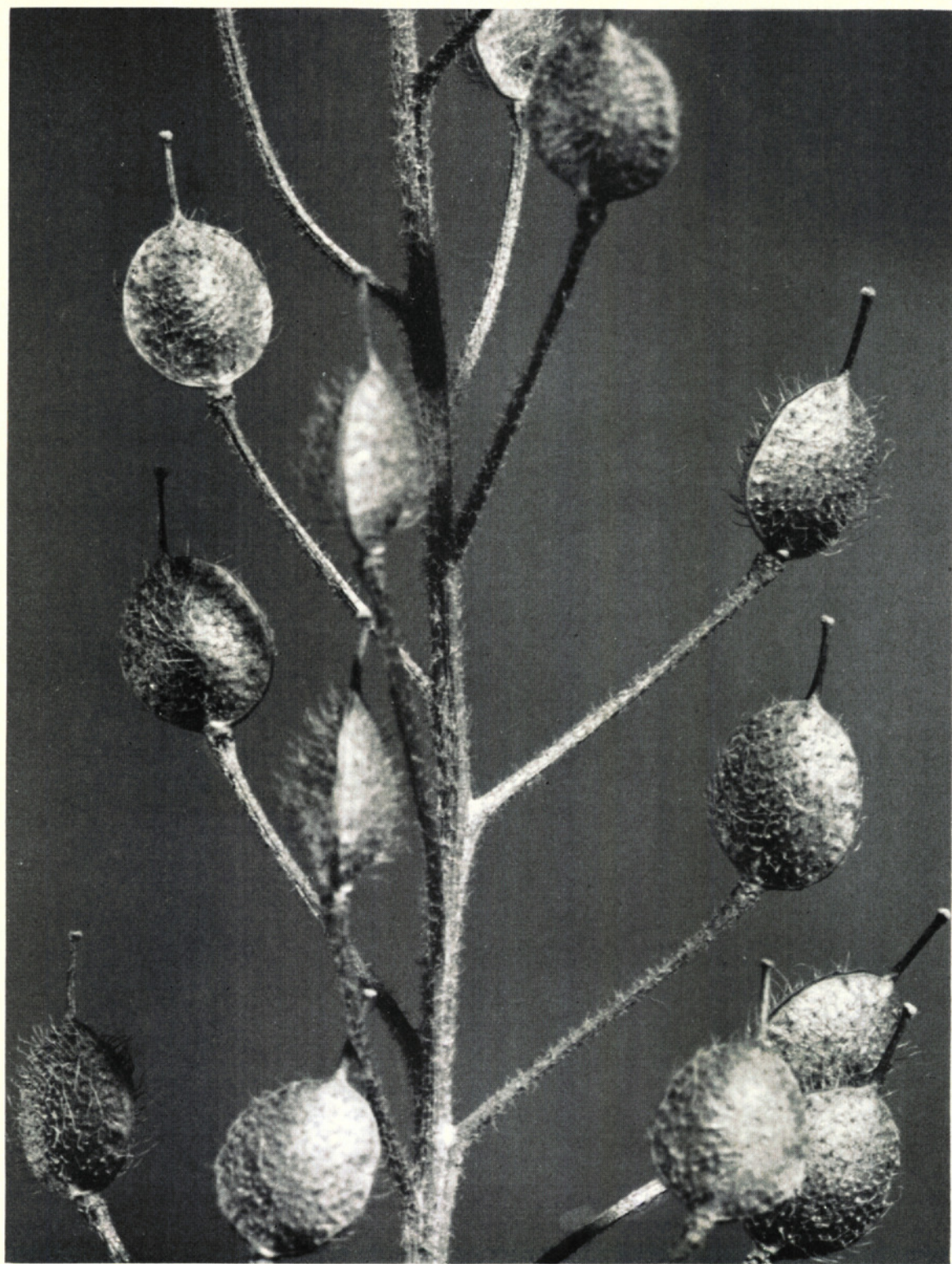
PLATE 1207. Lesquerella Lescurii . Part of an infructescence, \times 6 (Rollins 55174).