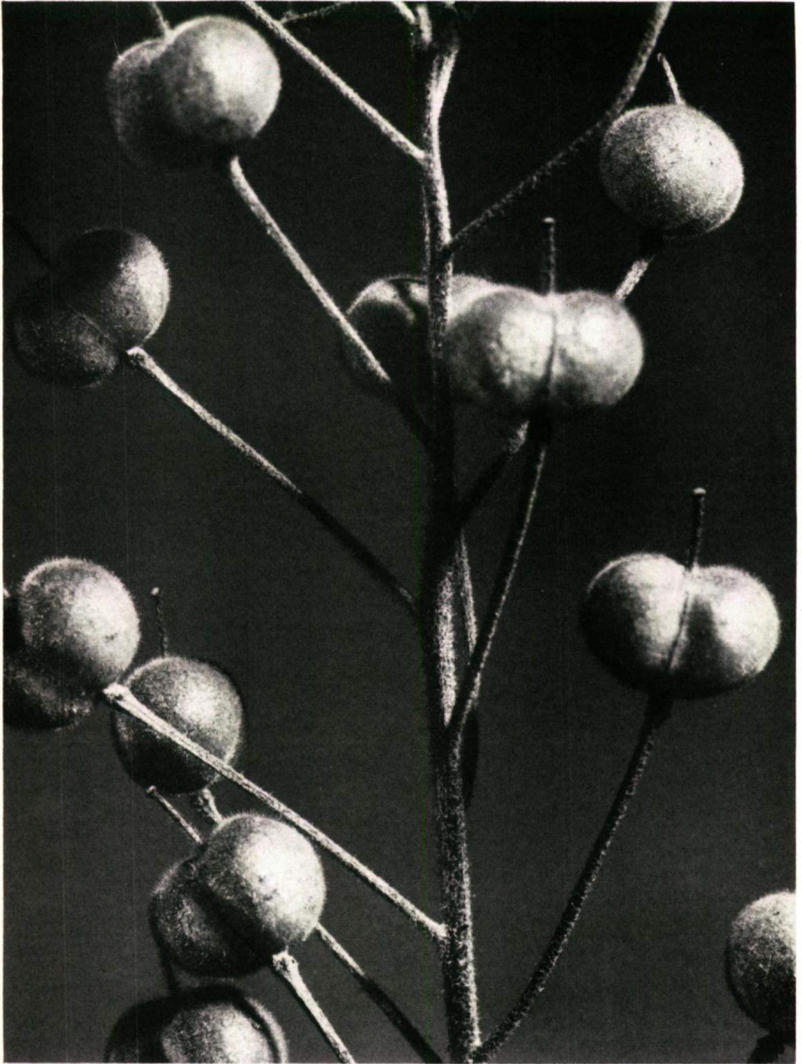
PLATE 1210. Lesquerella stonensis . Part of an infructescence, \times 6 (Rollins, 55176).