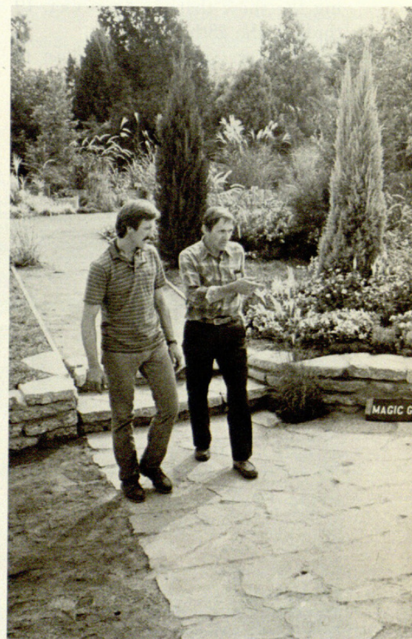
Left: Vegetables thrive in Rosebrock's raised gardens.