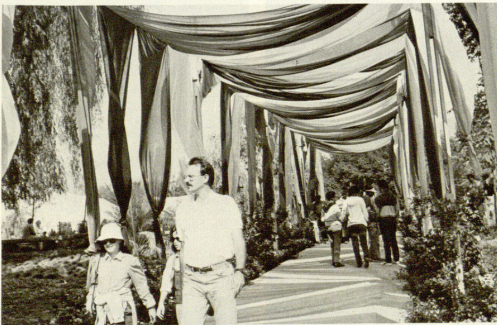
Visitors enter GARDEN SHOW '84 through a banner-draped corridor. Photos by William Aplin.

Color displays — first place, Monrovia Nursery; special mention, Rogers Nursery.