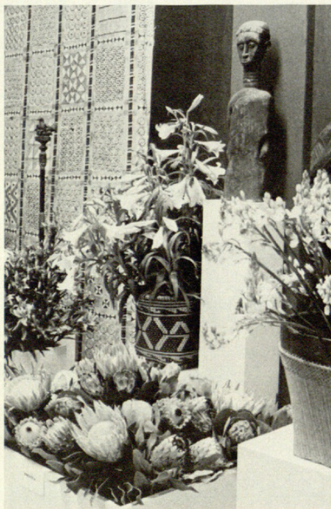
South African flowers and artifacts.