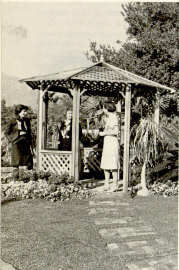
Landscape Assistance's gazebo.