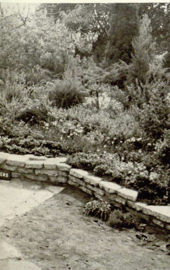
Above: The prize-winning garden by Magic Growers.