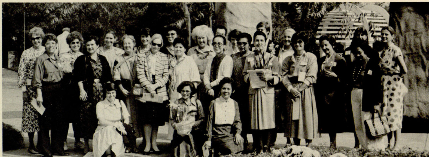
Above Wives of the Los Angeles Consular Corps return for their second annual visit to the Los Angeles Garden Show.