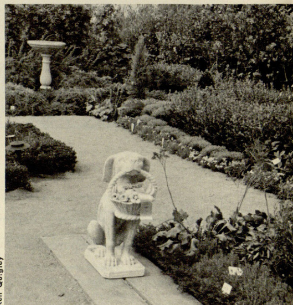
Above A formal garden by Hines Nursery and Landscape Assistance won several awards at the Garden Show.

With the 1987 show finished, work began for the next edition of the Los Angeles Garden Show which will run Oct. 14-23, 1988.