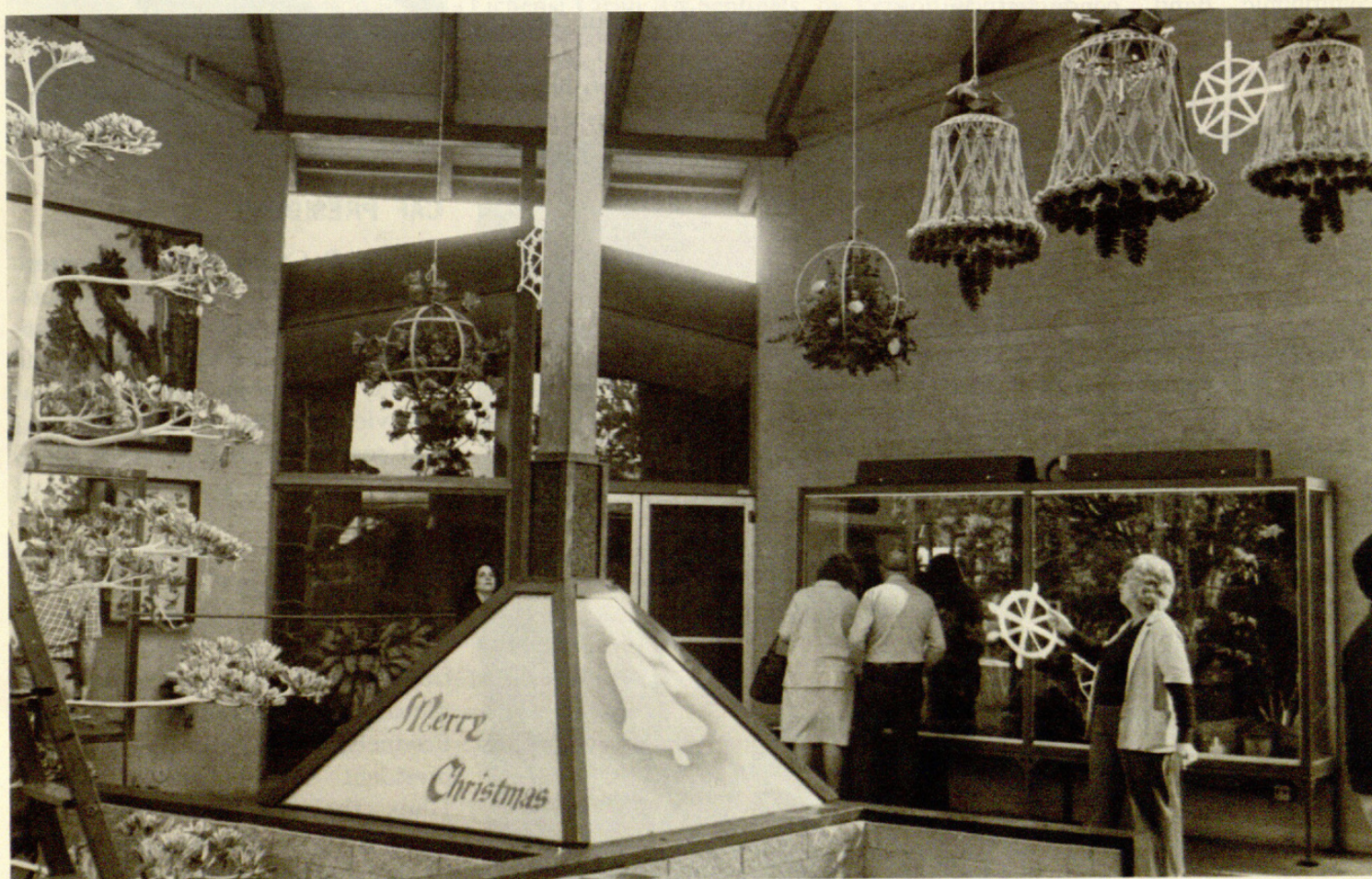
The Rotunda at the Arboretum is decorated during the Holiday Season with flowering poinsettias, dried plant arrangements, and handmade macrame ornaments. The display expands each year as more decorations are completed.