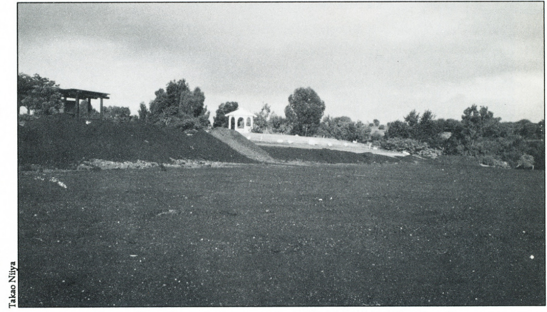
Clearing and grading have been completed in preparation for the roses.

Telephone Pioneers of America, a group of retired telephone company employees who have tackled several projects at SCBG, replanted rose bushes salvaged from the old rose garden.