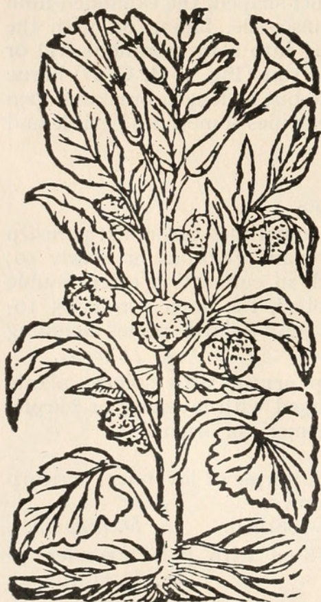
Fig. 2. Datura metel L. Illustration of J. Bauhinus under the name " Stramonium multis dicta sive Pomum spinosum ," Hist. Pl. 3: 624. 1651, cited by Linnaeus in his Hortus Cliffortianus .

In the second edition of the Species Plantarum (1762) Linnaeus adds to his citations Rumph's Herbarium Amboinense (5: pl. 87. 1755), in which the