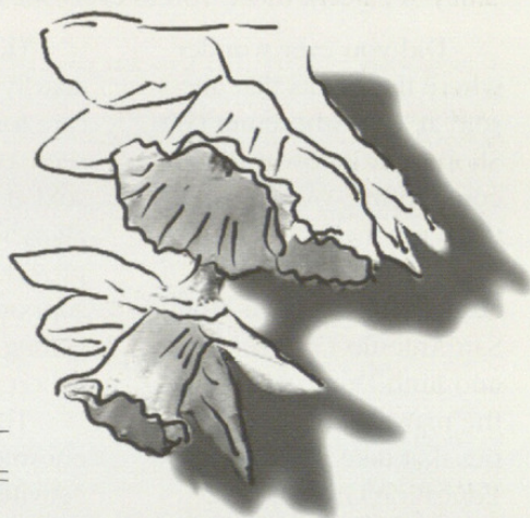
Below: Aloe marlothii 's imposing spiny leaves frame its spectacular flower display.

Daffodils ( Narcissus ) are in bloom at many different locations in The Arboretum.