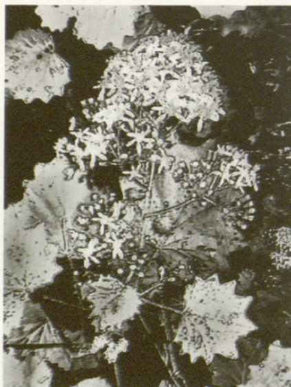
Below: Roldana petasitis displays clusters of yellow flowers above large, decorative leaves.

Daffodils ( Narcissus ) are in bloom at many different locations in The Arboretum.