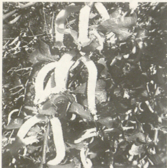
Above: Acacia denticulosa 's bright yellow flowers look like small cat-tails.