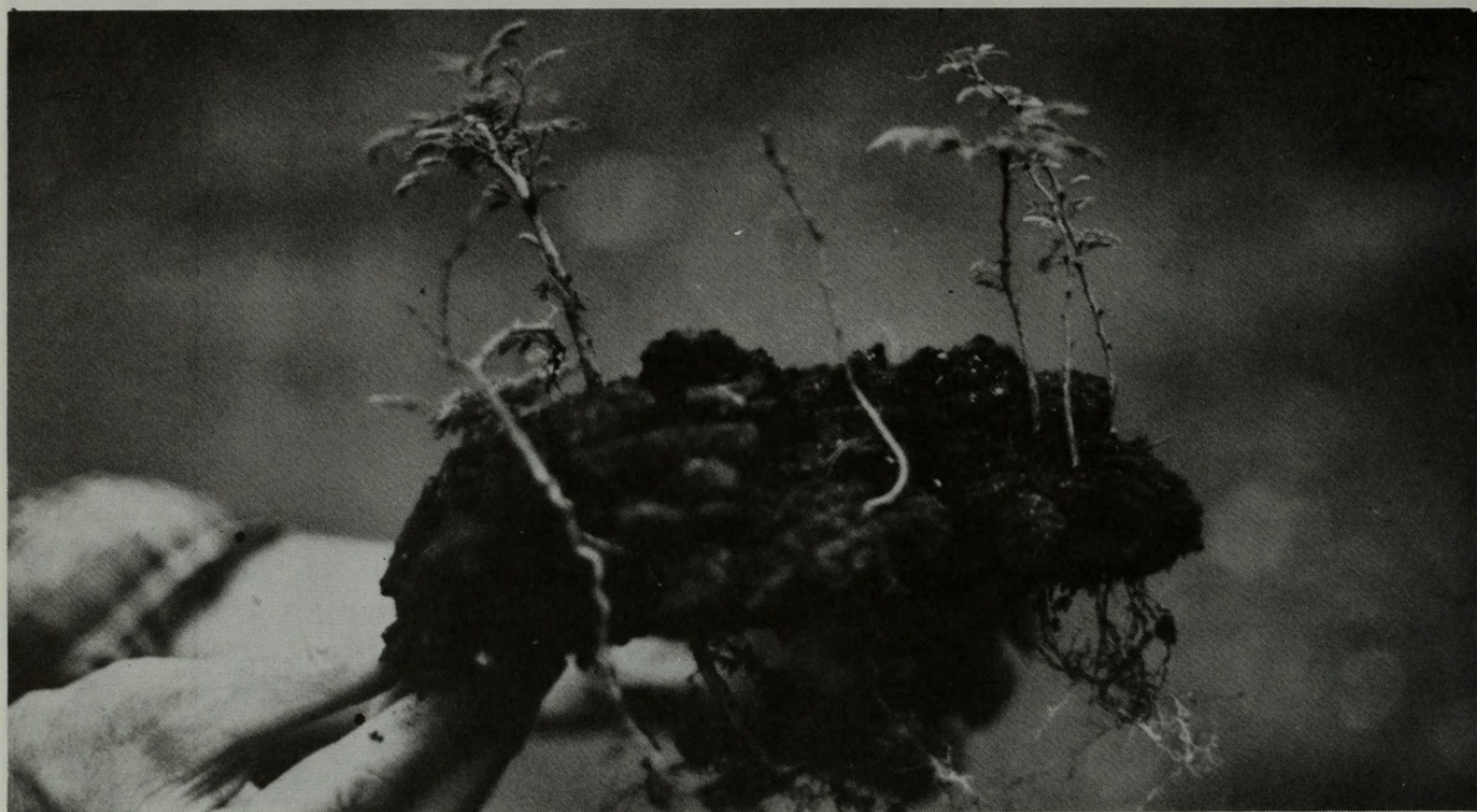
Fig. 2. Cow dung with seedlings of Acacia macracantha . Note the roots below the dung that extended into the soil. Las Mercedes, Prov. Pedernales, Dominican Republic.

the manure, which they proceeded to move across the mined-out area. The beetles acted in pairs, one pulling and one pushing. We tracked dung balls and beetles a dozen yards or more to a spot where one pair of beetles was busy burying the ball. On a hunch, we took the dung ball from the beetles and broke it open to reveal a single seed of Acacia macracantha . A dozen more balls were collected and all but one contained at least one Acacia seed. A few beetles were collected in alcohol and returned to Cambridge, where they were identified by entomologists of the Harvard Museum of Comparative Zoology as Scarabaeidae: Coprinae: Canthon violaceus .