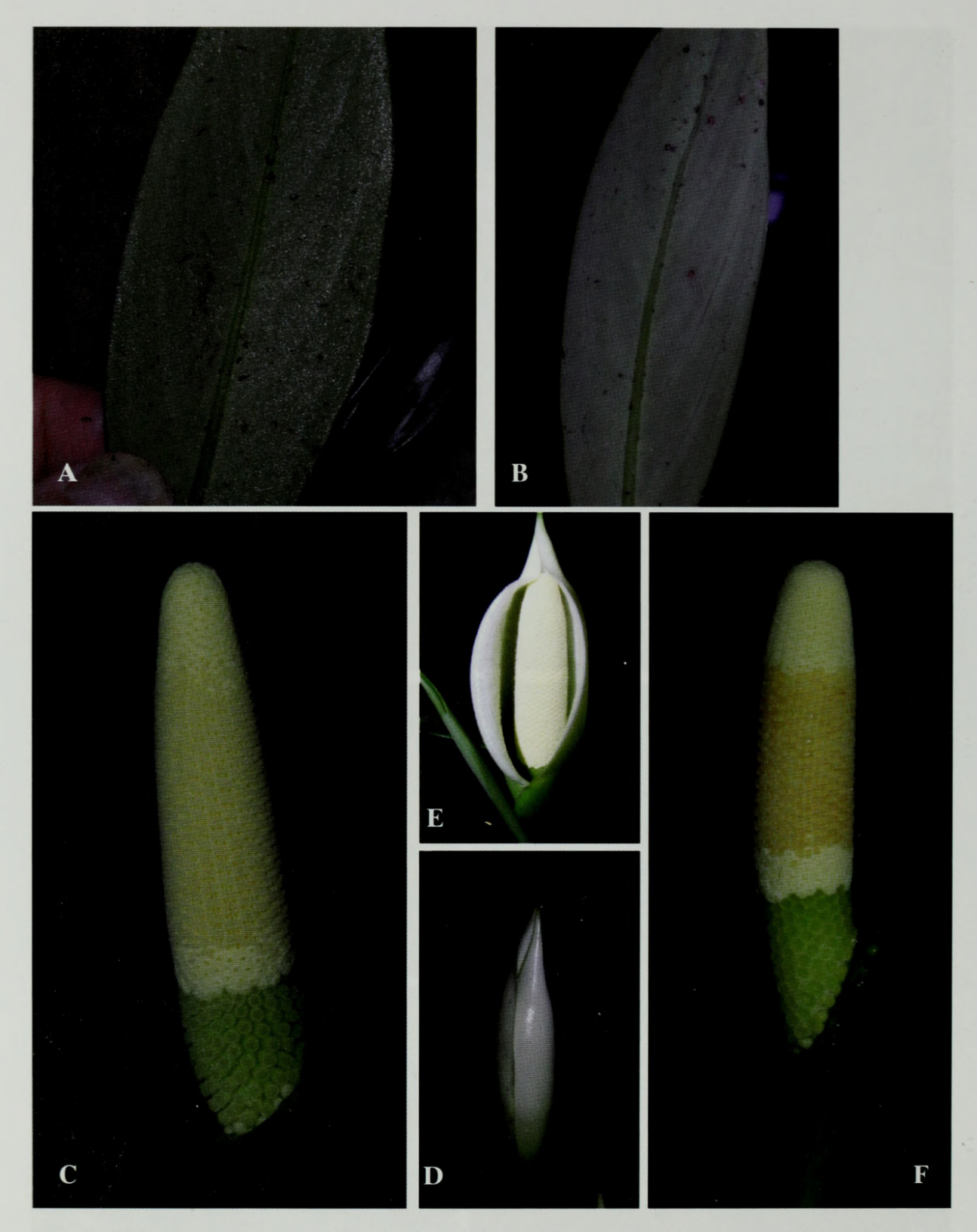
Plate 2: Aridarum crassum S.Y.Wong & P.C.Boyce (Figs. A, C & E) and Aridarum nicolsonii Bogner (Figs. B, D & F): A. Abaxial surface of leaf lamina of Aridarum crassum showing obscure primary lateral venation and conspicuous raised punctae. B. Abaxial surface of leaf lamina of Aridarum nicolsonii showing showing weakly raised primary lateral venation. C. Spadix of A. crassum (spathe artifically removed) to display stigma smaller than ovary and tapering male zone. D. spathe of Aridarum nicolsonii at gaping stage. E. Inflorescence of A. crassum at male anthesis. F. Spadix (spathe artifically removed) of Aridarum nicolsonii to display stigma smaller than ovary and cylindrical male zone.