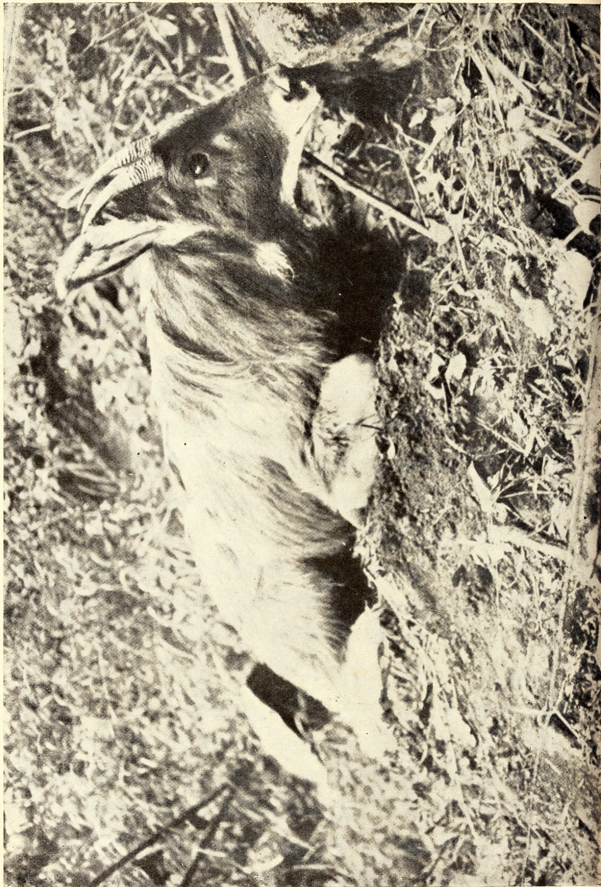
Large female Kashmir Serow showing white area on the undersurface of the jaw.