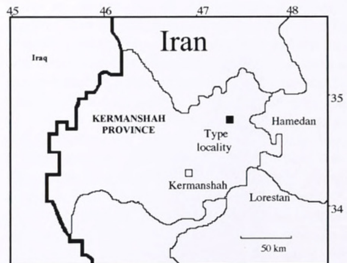
Figure 2. The type locality of Eremias (Eremias) montanus , vicinity of the Village of Siah-Darreh, about 60km northeast of the city of Kermanshah, Kermanshah Province, western Iran.

The lacertid genus Eremias Fitzinger, 1834 encompasses about 33 species of mostly sand, steppe, and desert dweller lizards which are distributed from northern China, Mongolia, Korea, Central and south-west Asia to southeastern Europe (Rastegar-Pouyani and Nilson, 1997). The genus is Central Asian in its relationships and affinities (Szczerbak, 1974). About 15 species of the genus Eremias occur on the Iranian Plateau mostly in northern, central, and eastern regions (Rastegar-Pouyani and Nilson, 1997; Anderson, 1999). To date, no comprehensive study has been carried out on Eremias fauna of the Iranian Plateau and the systematic status of most taxa is in great need of a revisionary work. Szczerbak (1974), however,