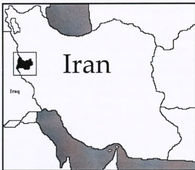
Figure 1. Location of Kermanshah province on the Iranian Plateau.

Key words. — Lacertidae, Eremias , Eremias (Eremias) montanus , Western Iran, Zagros Mountains, Kermanshah province, Siah-Darreh