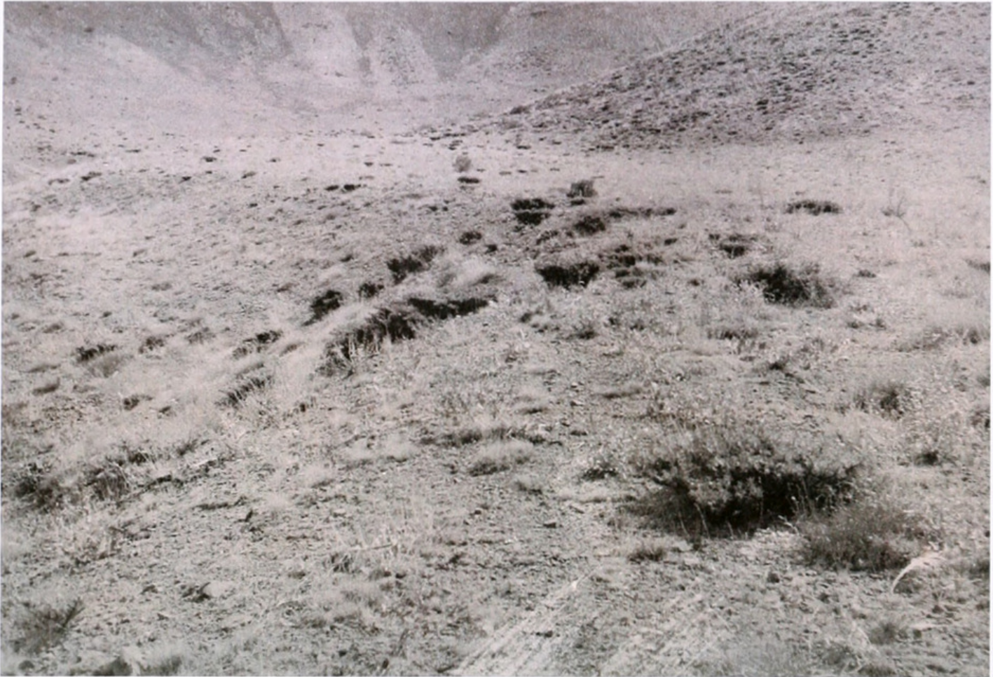
Figure 5. Habitat and type locality of Eremias (Eremias) montanus . 60 km northeast of Kermanshah, vicinity of Siah-Darreh village, Kermanshah Province, Western Iran.

Etymology: Eremias montanus is so named as it is apparently restricted in distribution to the upland and mountainous steppes of northeastern regions of Kermanshah province, western Iran.