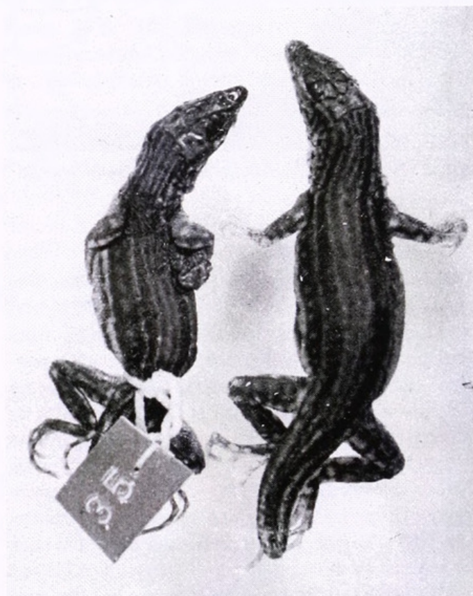
Figure 4. Eremias (Eremias) montanus paratypes.