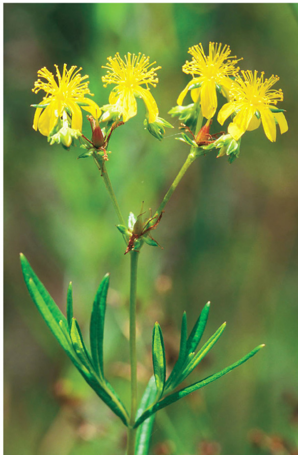
FIG. 1. Hypericum adpressum . Saline County, Arkansas. Note revolute leaf margins. 20 June 2006.