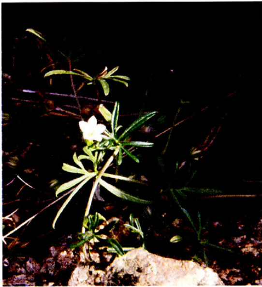
FIG. 2. Photographs of Ipomoea costellata var. edwardsensis flowers (from Nesom FW99 and O'Kennon).