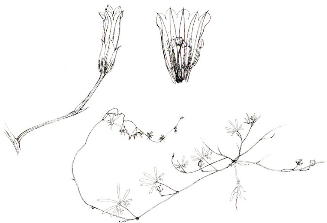
FIG. 1. Habit and floral details of Ipomoea costellata var. edwardsensis (from O'Kennon 8125).