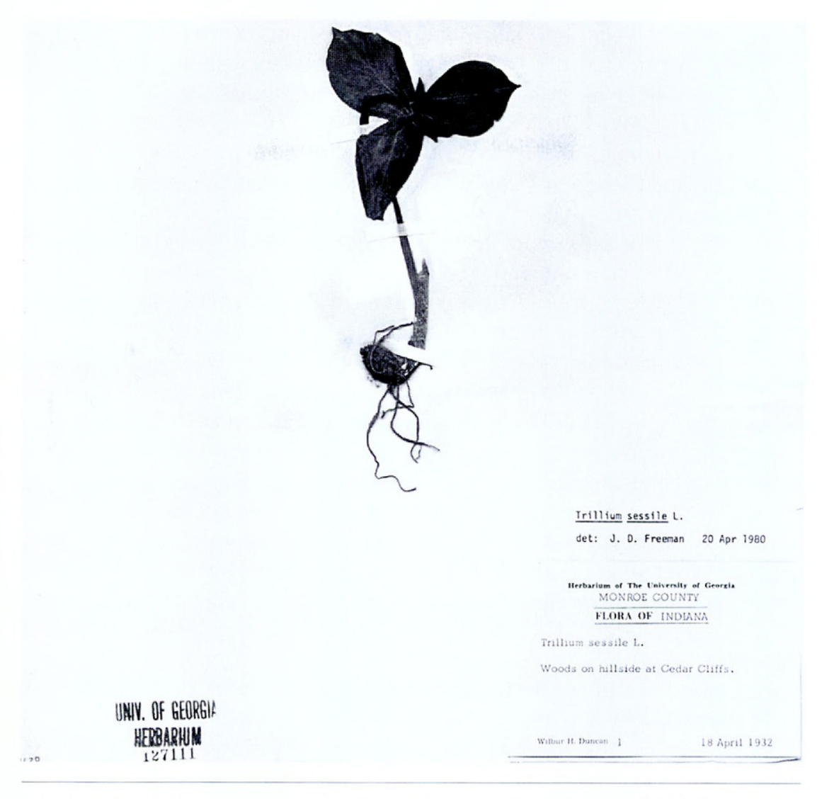
Fig. 3. Wilbur Duncan's first specimen ( Duncan 1; Trillium sessile L., Cedar Cliffs, Indiana; 18 April 1932; GA). Wilbur collected over 30,000 sets of vascular plant exsiccatae in his lifetime.

United States , a significant guide including 700 of his color photographs (Sheurer 1999).