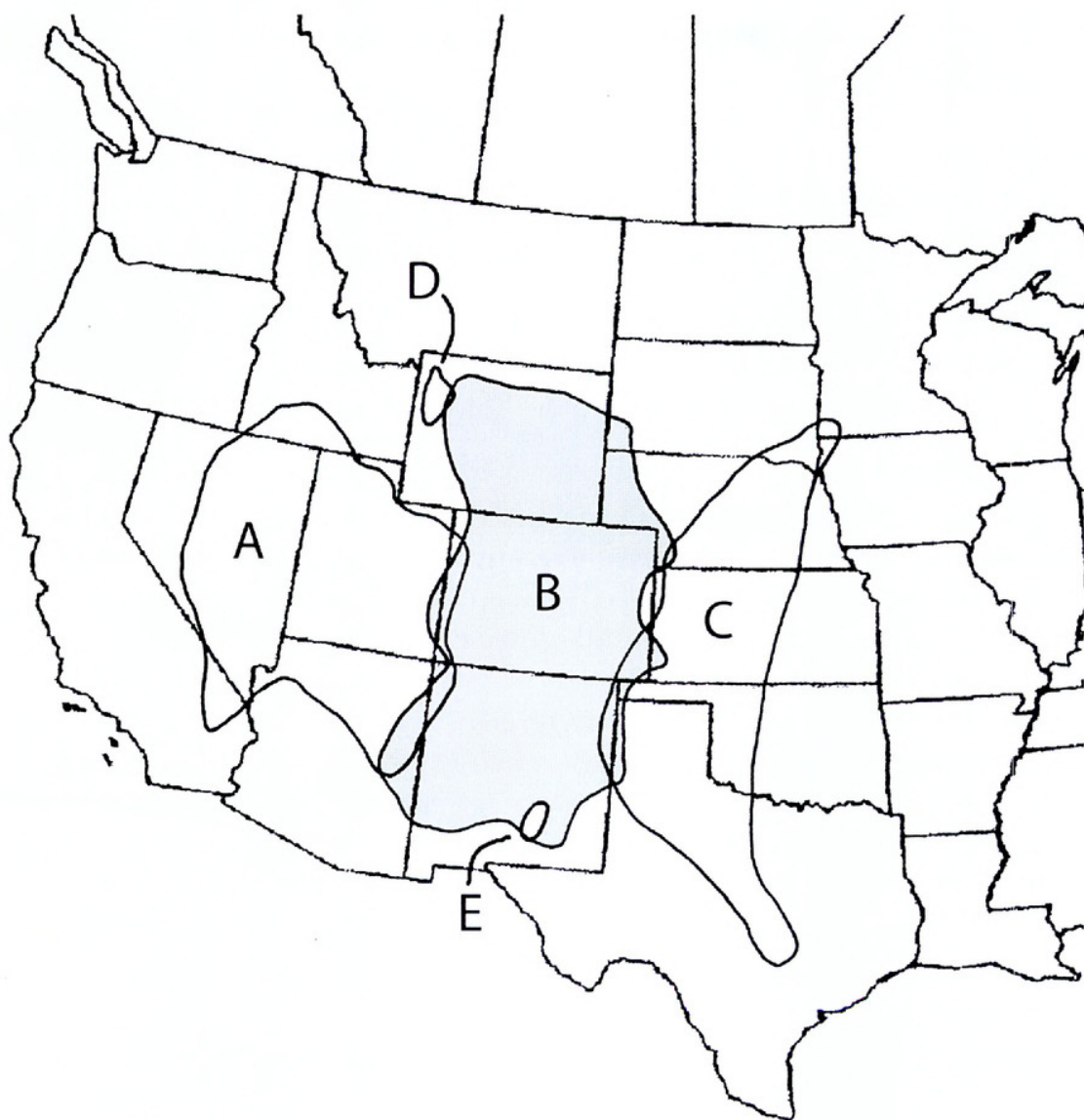
FIG. 3. Generalized distribution of (A) Heterotheca polothrix , (B) H. horrida , (C) H. stenophylla , (D) H. depressa , and (E) H. sierrablancensis . Illustrated are the distributions of taxa recognized here at specific rank.

Four Corners Heterotheca , I have been able to make only arbitrary morphological distinctions between var. pedunculata and var. minor .