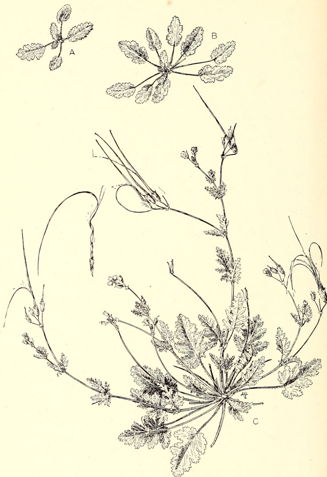
FIG. 2. Erodium Botrys f. montanum in different stages of growth.

than maximum length of lamina, finely hirsute, often glandular-haired, lamina ovate, 3-4 lobate and often sublobate, lobes incised-dentate. Cauline leaves opposite; petioles of lower portion