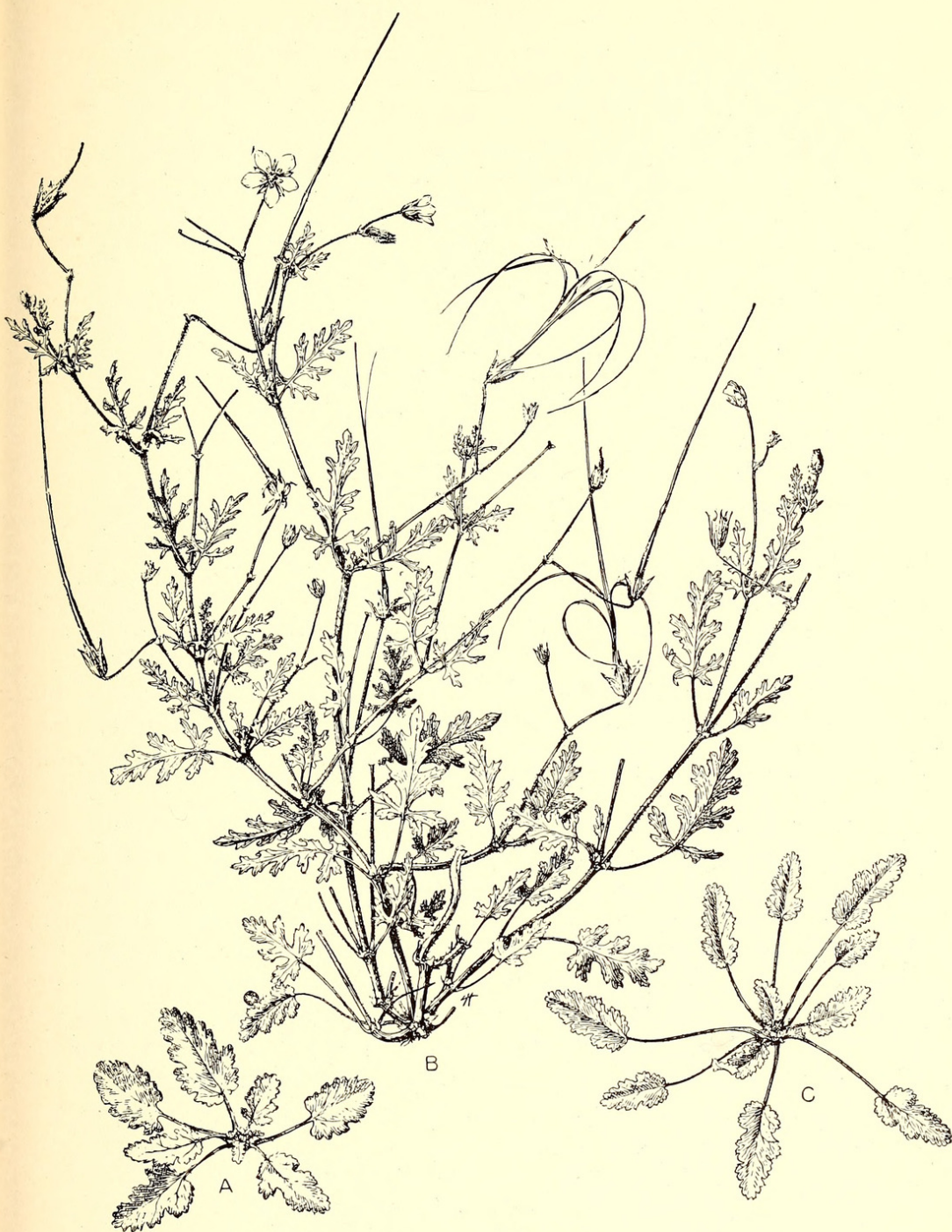
FIG. 3. Erodium Botrys in different stages of growth.

of stem often equal in length to maximum of lamina, upper sometimes sessile, finely hirsute, often sparsely glandular-haired, lamina ovate, 3-5 partite, mostly quadripartite, lower segment often divided, lobes acute, incised, sinuses narrow to moderate. All leaves setose-pilose especially on veins and margins, glandular hairs sometimes present. Stipules ovate, somewhat acute, membranous, pallid or dusky, ciliate, usually 3-4 mm. long and