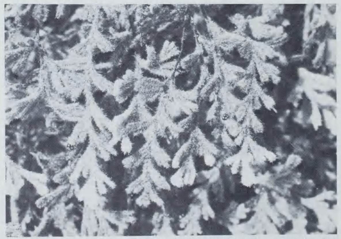
Fig. 2. Apteropteris applanata showing the flattened frond segments, the conspicuous sporangia protruding beyond the rim of the involucre, and the protruding, bristle-like receptacle which becomes conspicuous after the sporangia are shed, x c. 2.5.