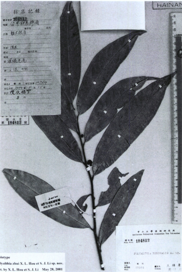
holotype polyalthia zhui X. L. Hou et S. J. Li sp. nov. ct. by X. L. Hou et S. J. Li May 28, 2001

Shrubs usually 1.5–3 m, rarely up to 5 m tall; bark dark brown; young twigs dark purple, striate, pubescent with appressed gray-yellow hairs, but quickly glabrescent. Leaves coriaceous, oblong-lanceolate or ovate-lanceolate, 9–16(–19) × 2.5–4.5(–5) cm, apex acuminate to obtuse-acuminate, base cuneate, glabrous, dark green above, lucid and pale green beneath, midrib slightly grooved above and obviously convex beneath, secondary veins 8 to 10 pairs, at 60° to 80° with the midrib, interarching 3–5 mm from the margin, reticulations somewhat prominent on both sides, intersecondary veins in 6 to 8 pairs; petioles 3–5 mm long, yellowish, rugose. Inflorescences extra-axillary with 1 (or 2) flowers; peduncles ca. 1 mm long; pedicels