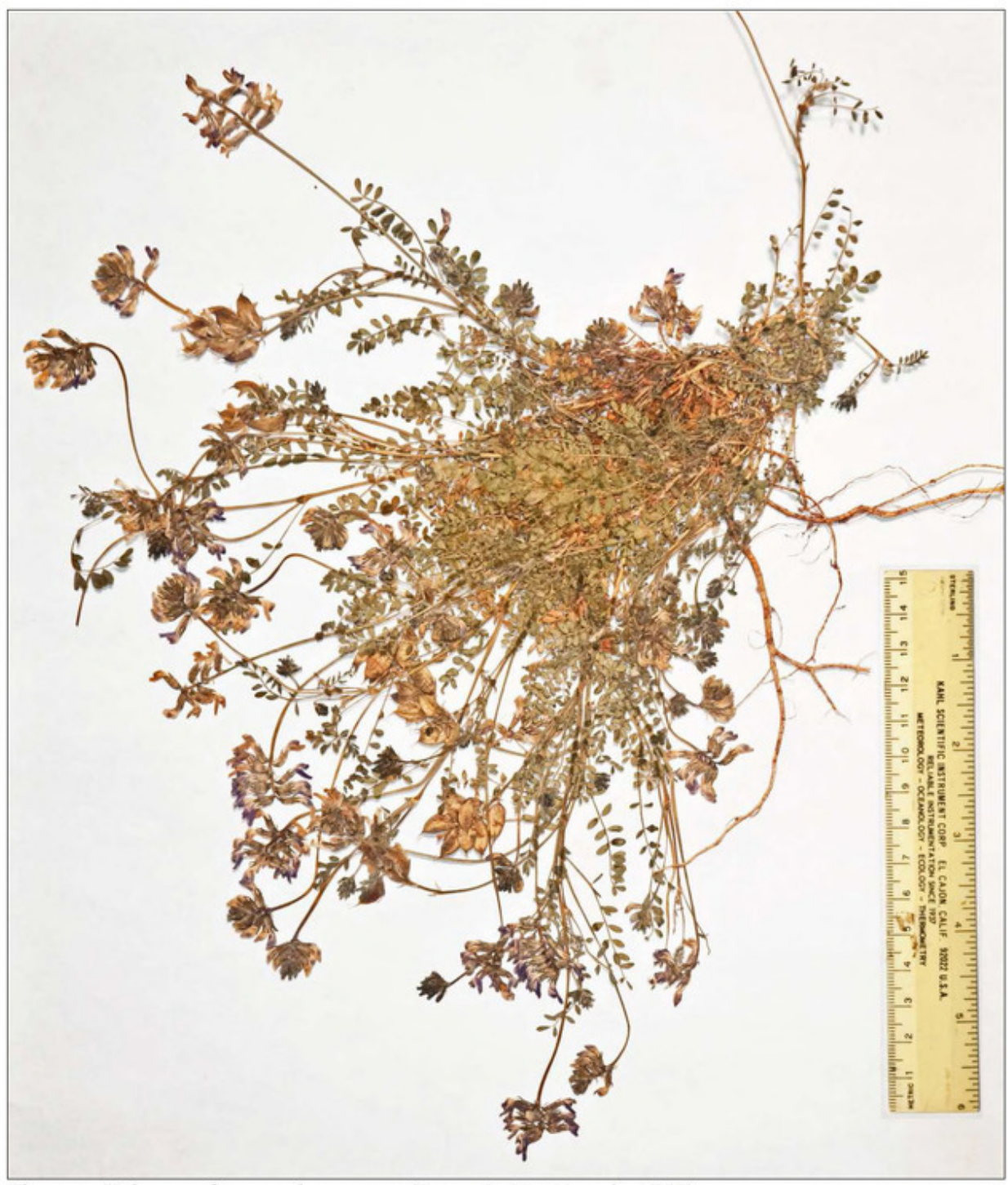
Figure 1. Holotype of Astragalus martinii (Reina-G. 97-458 et al., ARIZ).

Ouercus arizonica. Most of the paratypes are from flatter areas at 1900 to 2195 meters on top of Mesa del Campanero. In this area, pine-oak forest includes P. strobiformis and Q. jonesii. Beginning in the 1950s, large areas of pine-oak forest were cleared for apple and other fruit orchards (Rubén Coronado, pers. comm., 2007). Astragalus martinii mostly occurs in clayey soil on relatively flat rocky surfaces formed by weathered Oligocene basalt but also was found on disturbed roadsides and in a plowed cornfield near the village of Campanero. It was also found on rocky slopes in mesic pine-oak forest with Abies durangensis in Barranca El Salto on the western edge of Mesa del Campanero. In general, Astragalus martinii is known to occur between 1800 and 2200 meters elevation.