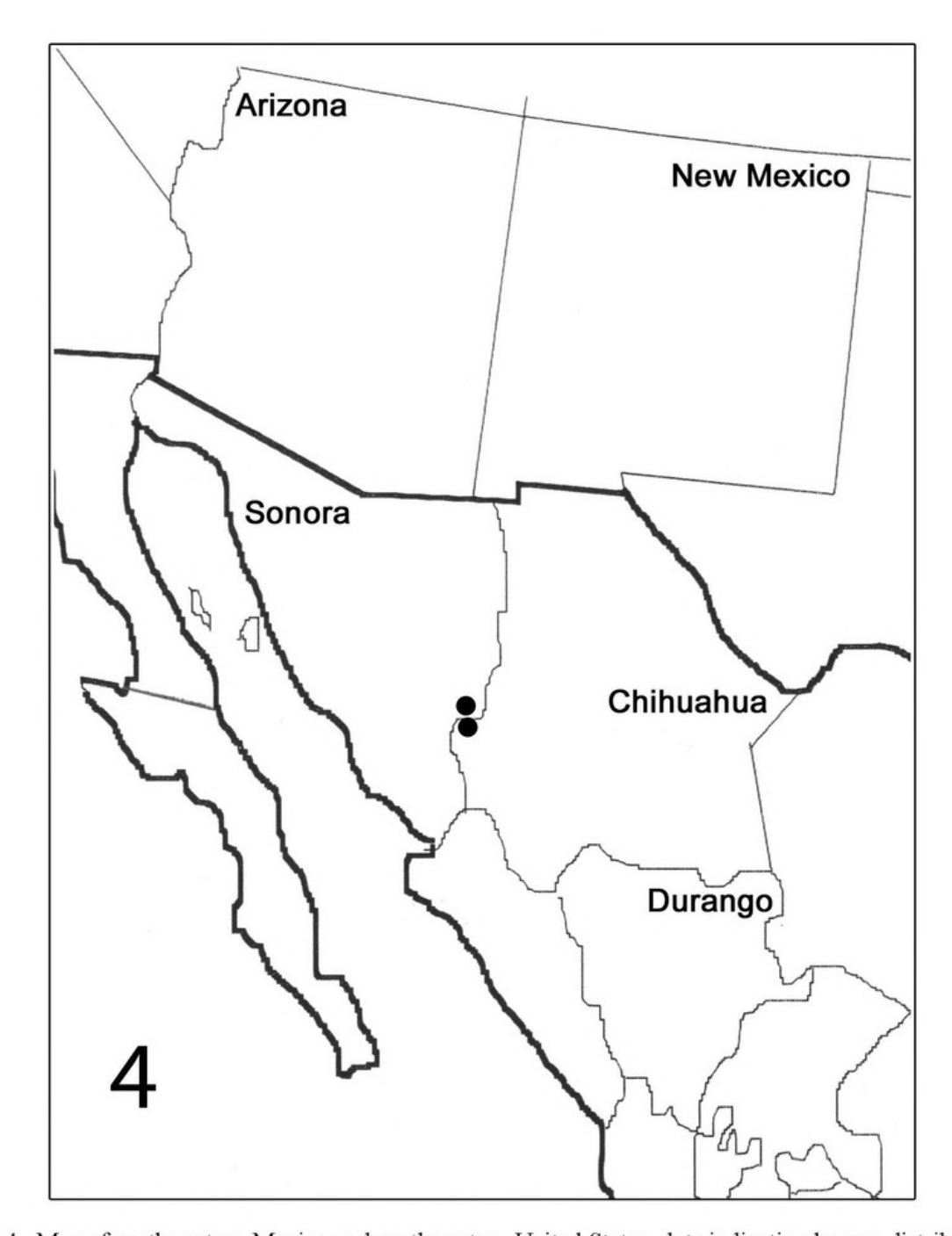
Figure 4. Map of northwestern Mexico and southwestern United States, dots indicating known distribution of A. martini. More northerly dot represents Mesa del Campanero, the more southerly dot the Sierra Obscura.

Astragalus martinii has two morphological extremes on Mesa del Campanero. Some plants are green, and large, with slightly larger pods and flowers in comparison to the other extreme, which consists of plants that are comparatively low, densely tufted, and grayish with denser pubescence, the flowers and pods averaging smaller. These phases may be ecologically induced, the smaller, more tufted phase recorded as being in the open, along roads, or in flat ponderosa pine forest. The type is more or less in the middle of the range of variation, being fairly large, green, and leafy, while at the same time fairly densely tufted. In the specimens citations we have noted which form the particular collection represents if it seems extreme by indicating "large, open" and "small, tufted."