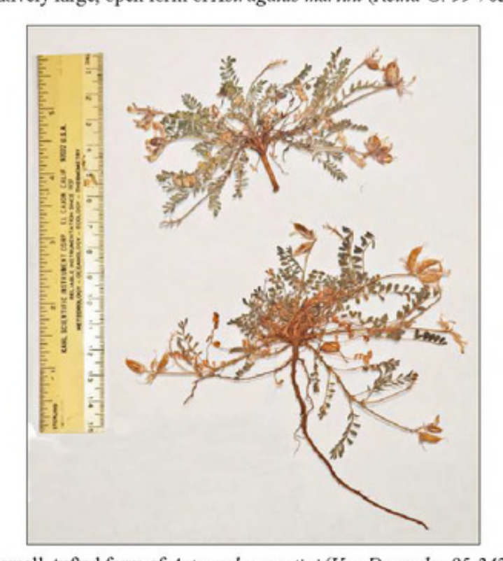
Figure 3. Comparatively small, tufted form of Astragalus martini (Van Devender 95-342 and Reina-G., NMC).