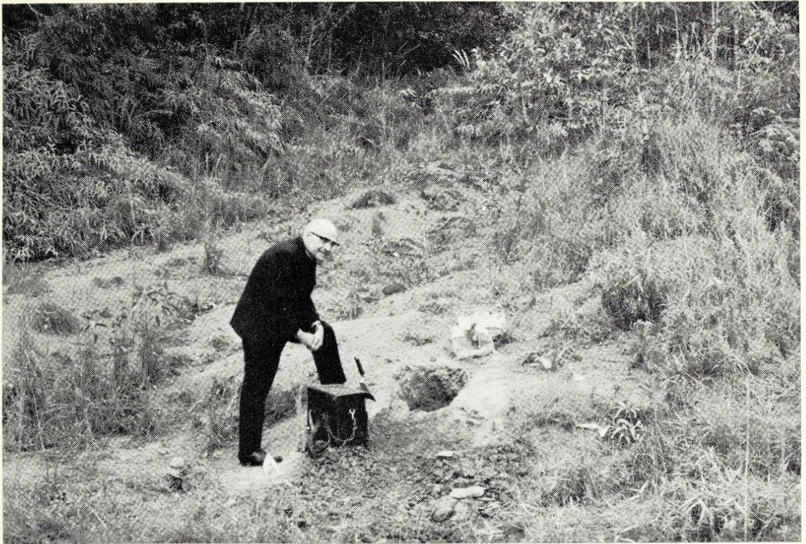
FIG. 1. Site of nest of Thygater analis near Antonina, Paraná, Brazil. Padre Moure is standing by the nest.