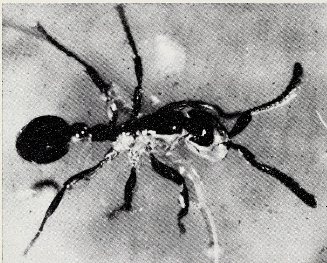
Fig. 2. N. ectopus n. sp. paratype worker: view of entire body. (Photograph courtesy of F. M. Carpenter).