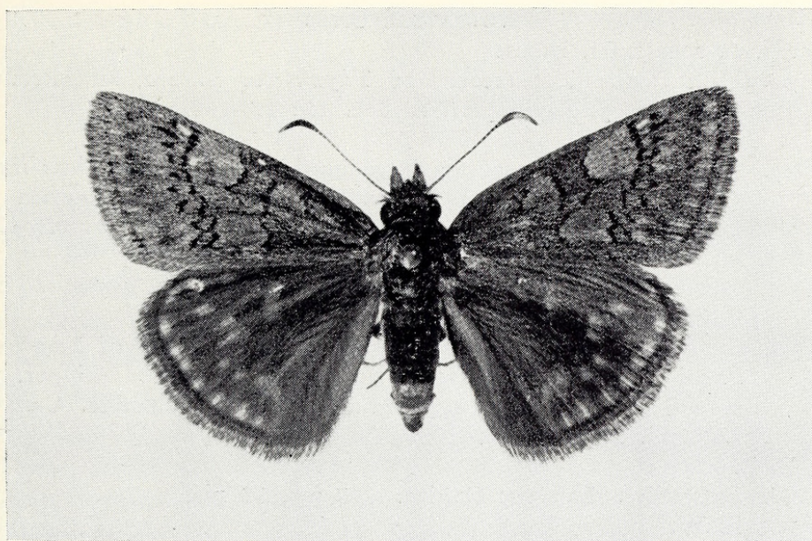
Fig. 2. The sleeping female of fig. 1 pinned and spread at a later time. Dorsal view. Her wingspread is about 38 mm.

The sleeping position of E. brizo , unlike that of various butterflies, affords little to no protection from weather; the skipper is exposed, but it is concealed visually from many potential predators. The cryptic posture is assumed so abruptly that a fast-moving skipper almost vanishes into a more or less static landscape.