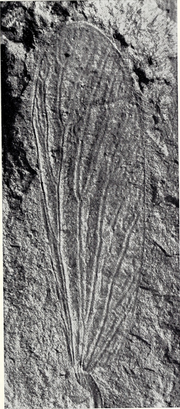
Fig. 1. Photograph of holotype forewing of Cretatermes carpenteri , new genus, new species.