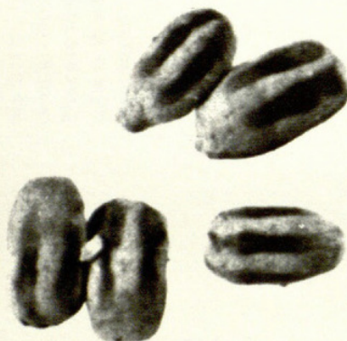
FIG. 2.—Longitudinal view of modern Incisitermes minor termite fecal pellets, magnified 15x their average length of 1.14 mm. Light colored parallel ridges alternate with darker, slightly concave sides.

30x magnification with an ocular micrometer (Table 2). Pellet diameter, measured mid-way along the length before tapering begins, is generally less variable than pellet length, measured from blunt to tapered end. A larger sample of 200 pellets of Pterotermes revealed population statistics nearly identical to those of the smaller 50-pellet sample, suggesting that a 50-pellet sample was representative.