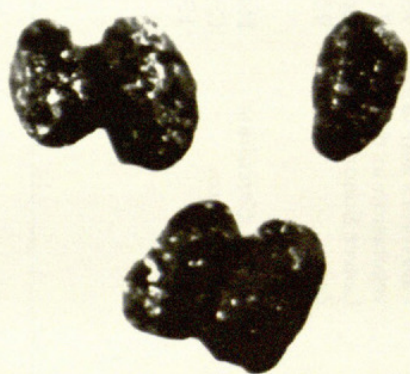
FIG. 3.—Longitudinal view of prehistoric charred termite fecal pellets from a site along the Gila River near Florence, Arizona. Although the pellets are magnified 17x their average length of .87 mm, they probably shrank when burned. Sometimes ancient pellets occur fused to one another.

Two possible routes of introduction of termite fecal pellets into ancient dwellings include transport in locally gathered firewood, and infestation of roof or side-wall construction material.