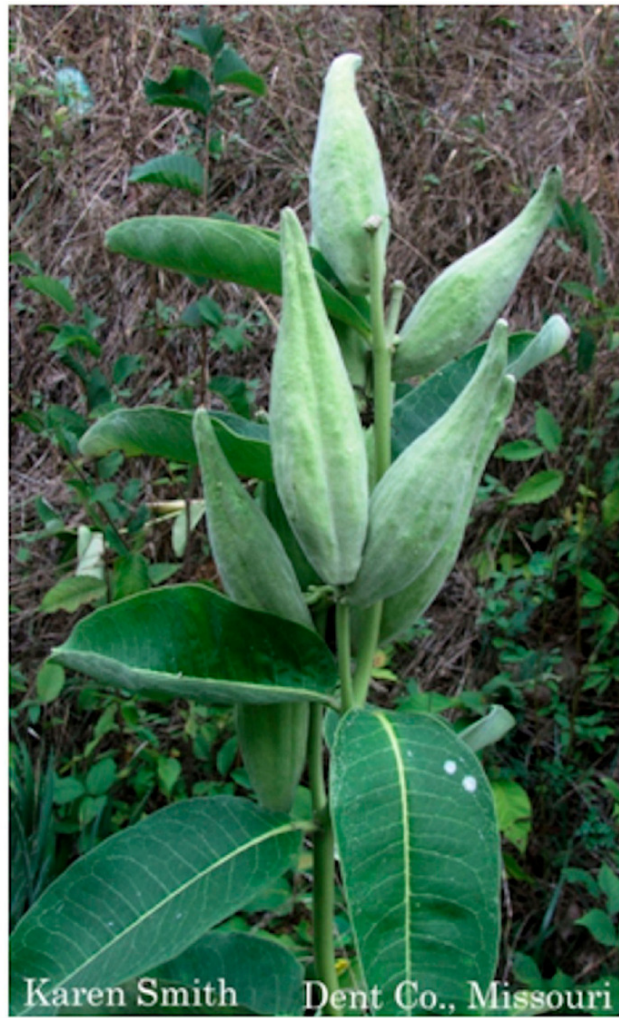
Figure 2. Asclepias syriaca x A. purpurascens . Hybrid with smooth fruits.