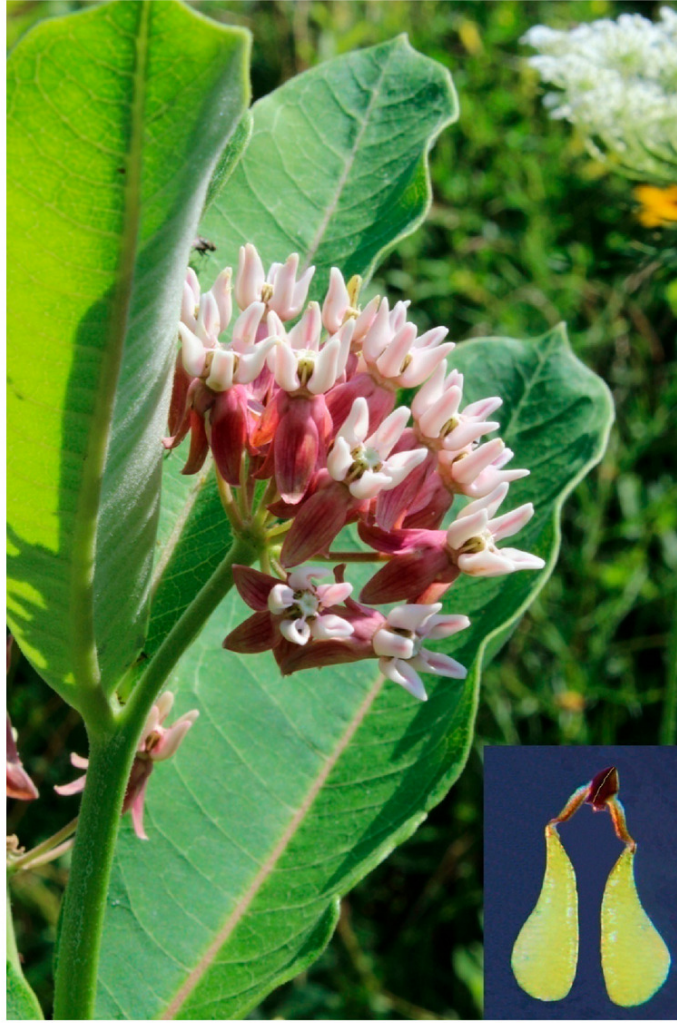
Figure 1. Asclepias syriaca x A. purpurascens . Hybrid flowers. Inset shows the pollinarium.