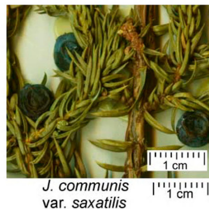
Fig. 2. Specimen of J. c. var. saxatilis from Mongolia.

The purpose of the present study was to compare the leaf volatile essential oils from J. communis , J. pygmaea and J. sibirica from Bulgaria to determine if their oils differ.