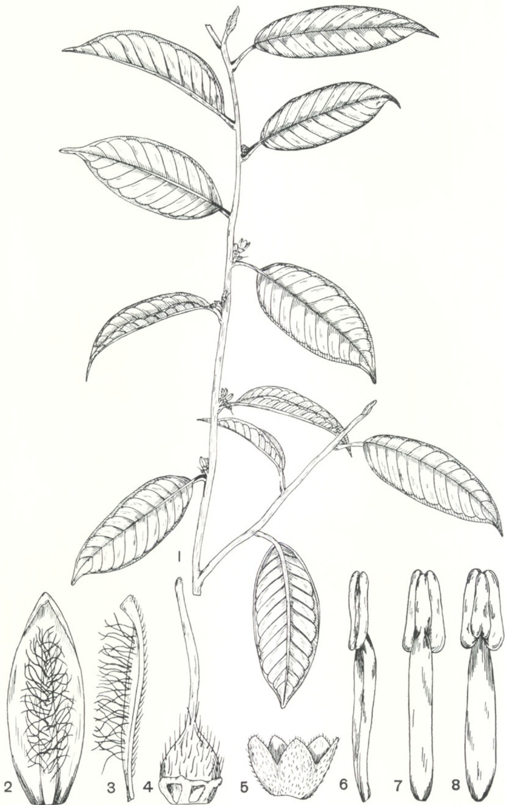
EMMOTUM CONJUNCTUM Howard