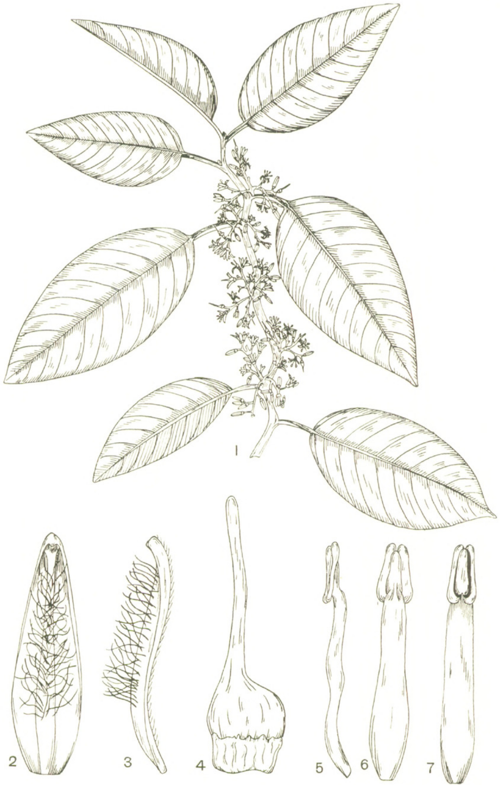
EMMOTUM FLORIBUNDUM Howard